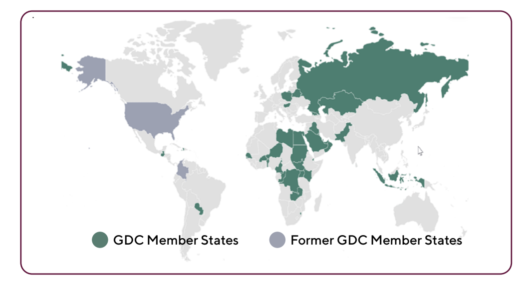
Figure 1: Current Geneva Consensus Declaration Signatories

While Protego is not mentioned by name in The Mandate, it is implied in a recommendation for launching a new approach that focuses on 'Holistic Health Care and Support for Women, Children, and Families'. It asks that the next leadership at USAID focus attention on women's and children's health (including unborn children) as well as health risks across the lifespan<sup>41</sup>.