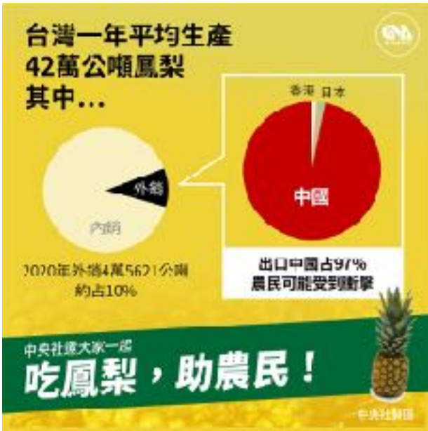
Export of pineapple to China in 2020 is 97%

Under CCP's economic weapons, Taiwan government and industry have already raised their crisis awareness and began expanding diversified markets. Take the export of Pineapple as an example.