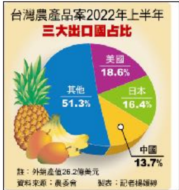
Export of pineapple to China in 2022 is 13.7%, to Japan is 16.4%, to USA is 18.6%, to other countries is 51.3%

§2. Raising high-standard trade regulations and preparing to get international Trade Union membership.