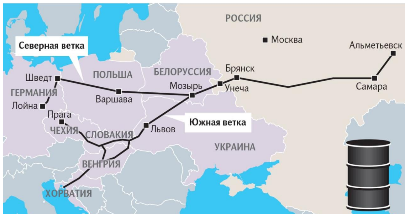
The route map of the Druzhba oil pipeline 42

Using Kazakhstan as an alternative source of oil and oil products in the European Union above Kazakhstan's existing annual supply volumes would undermine the political objective of the West to deprive Russia of the means to wage military aggression against Ukraine.