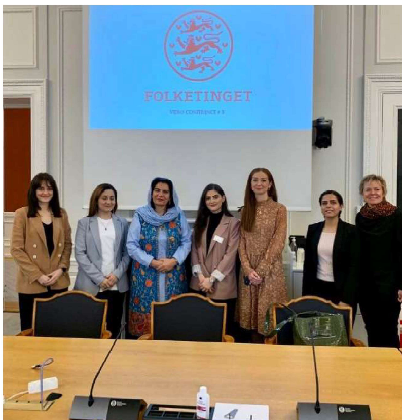
Afghan diaspora women dialogue with the Danish MPs, 2021