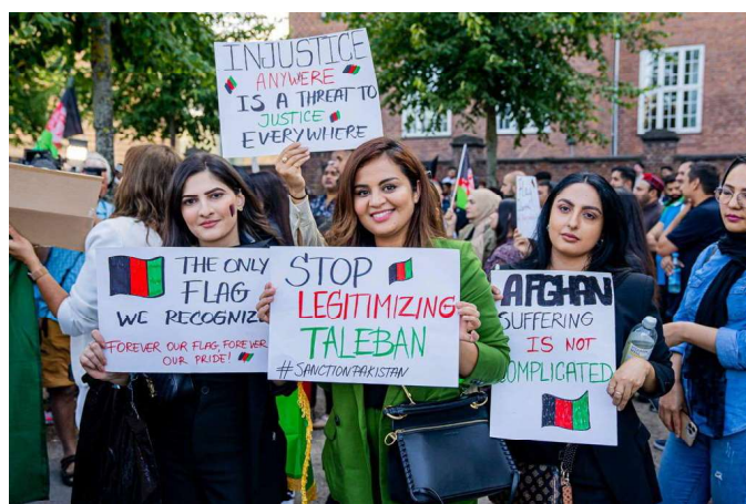
Afghan demo in Denmark