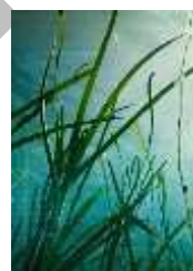
Eelgrass in Kertinge Nor