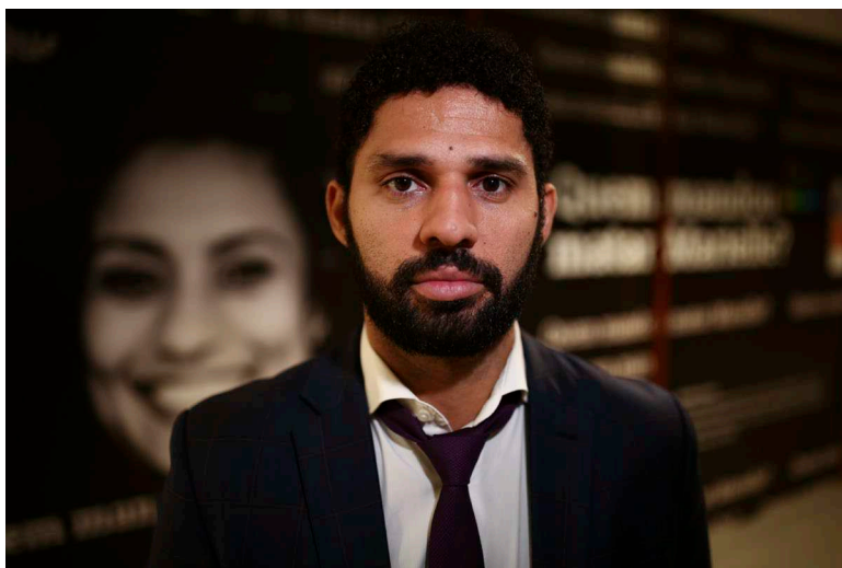
Brazilian member of parliament David Miranda of the Socialism and Freedom Party (PSOL) poses during an interview with AFP at his office of the National Congress in Brasília, on 5 November 2019.

Decision adopted unanimously by the IPU Governing Council at its 206 th session (Extraordinary virtual session, 3 November 2020)