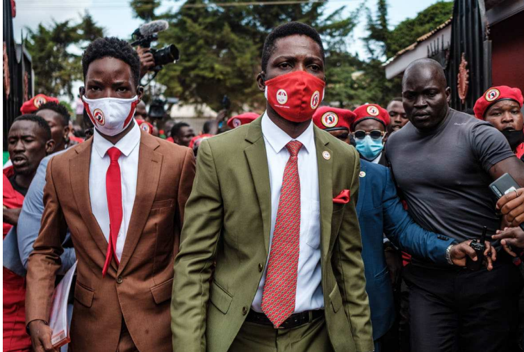
Mr. Robert Kyagulanyi, aka Bobi Wine, arrives at the headquarters of his political party in Kampala, Uganda, on 21 August 2020.

Decision adopted unanimously by the IPU Governing Council at its 206 th session (Extraordinary virtual session, 3 November 2020)