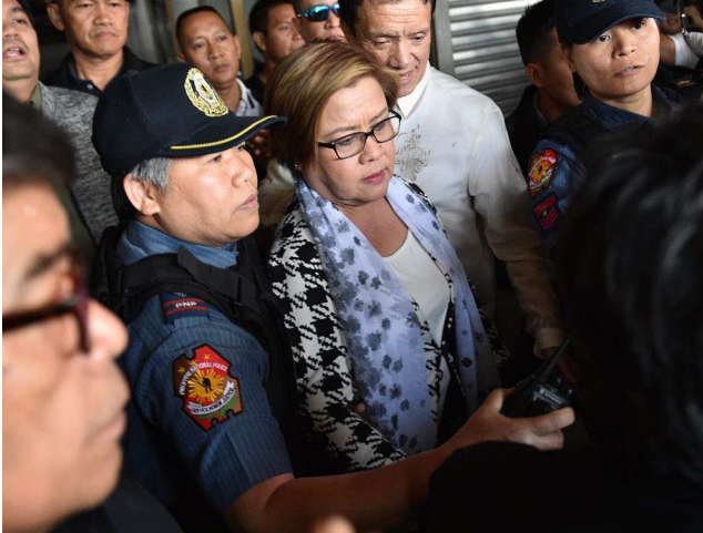
Philippine Senator Leila de Lima is escorted by police after her arrest at the Senate in Manila on 24 February 2017

Decision adopted unanimously by the IPU Governing Council at its 206 th session (Extraordinary virtual session, 3 November 2020)