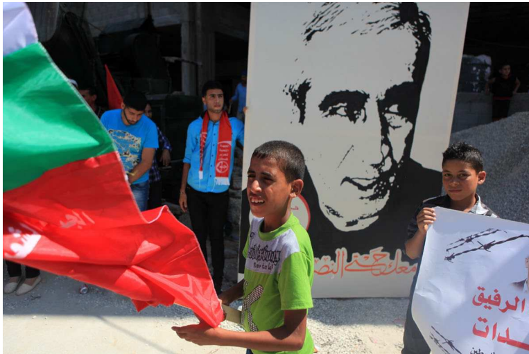
Palestinian supporters of the Popular Front for the Liberation of Palestine (PFLP) take part in a protest outside the UNDP office calling for the release of Ahmad Sa'adat, leader PFLP, in Gaza city on 29 July 2015.

Decision adopted by consensus by the IPU Governing Council at its 206 th session (Extraordinary virtual session, 3 November 2020) 5