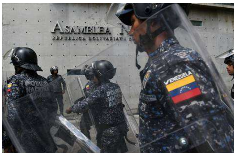
Venezuelan National Police members stand guard outside the National Assembly on 7 January 2020 in Caracas

Decision adopted unanimously by the IPU Governing Council at its 206 th session (Extraordinary virtual session, 3 November 2020)