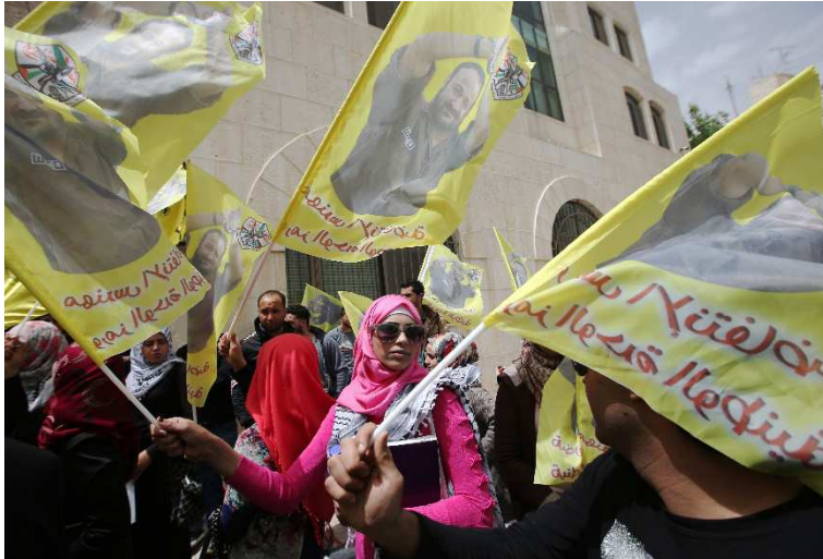
Ramallah, 15 April 2015 – Palestinian protesters wave flags bearing portraits of Fatah leader, Marwan Barghouti, during a march to mark the anniversary of his arrest.

Decision adopted by consensus by the IPU Governing Council at its 206 th session (Extraordinary virtual session, 3 November 2020) 4