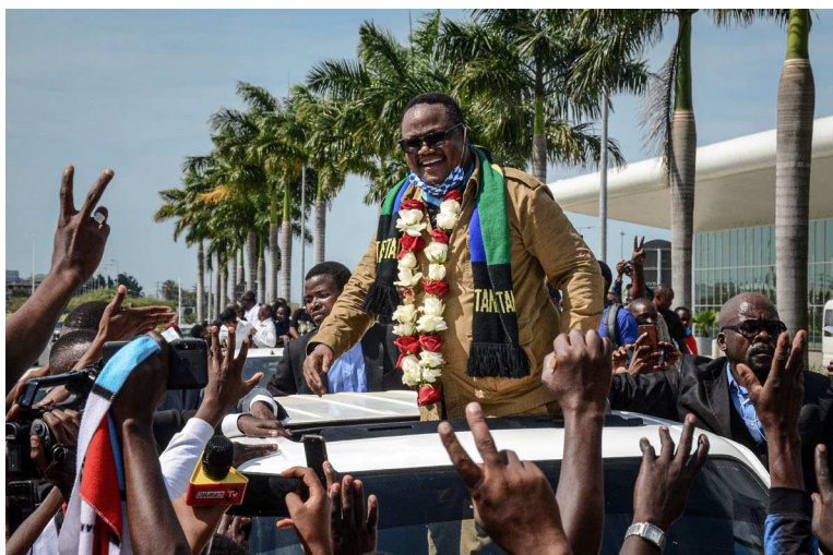
Mr. Tundu Lissu (centre), reacts to supporters upon his return on 27 July 2020 to Tanzania after three years in exile following a failed attempt on his life.

Decision adopted unanimously by the IPU Governing Council at its 206 th session (Extraordinary virtual session, 3 November 2020)