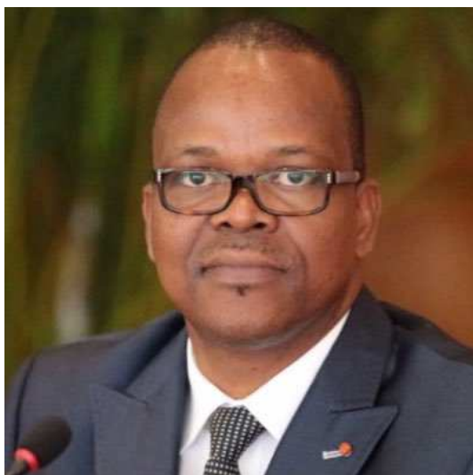
Alain Lobognon, Twitter

Decision adopted unanimously by the IPU Governing Council at its 206 th session (Extraordinary virtual session, 3 November 2020)