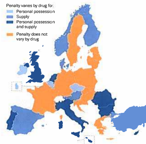
FIGURE 1 Penalties in law for drug offences in the European Union, Norway and Turkey

determine different legal degrees of severity of penalty in definition and prosecution of offences. Cannabis is often included among those drugs that do not incur the maximum legal response. For example, in Cyprus, Italy, the Netherlands, Portugal and the United Kingdom, legal penalties for offences relating to the use and supply of the class of drugs including cannabis are less severe than those for offences related to other substances. Strikingly, no other substance listed in Schedule IV of the 1961 Convention (which lists substances particularly liable to abuse and to cause ill-effects) attracts lower penalties in this way. By contrast, in Bulgaria and Romania, cannabis is listed as a substance that carries a higher degree of risk than drugs in other categories, and the penalty for supply is more severe. For (minor) use-related offences involving cannabis, penalties are set lower than those for other drugs in Belgium, the Czech Republic, Ireland, Luxembourg and Malta. For drug supply offences in Denmark, Finland and Spain, the law prescribes a higher penalty for drugs referred to as more dangerous or harmful. Prosecution and sentencing directives, and