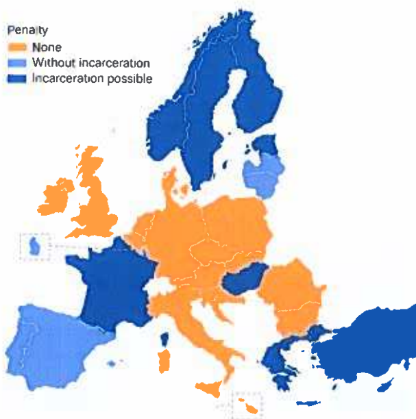
FIGURE 2 Penalties in law for consumption of cannabis in the European Union, Norway and Turkey

NB In Spain consumption is penalised when the offence is committed in a public place.