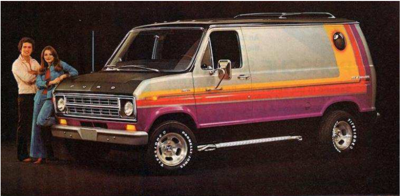
Ford designed the van. Local custom shops design and furnish such items as porthole windows, "mag" wheels, fat tires, sidepipes and special paint themes.