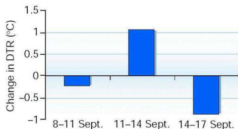
Figure 1 Departure of average diurnal temperature ranges (DTRs) from the normal values derived from 1971–2000 climatology data for the indicated three-day periods in September 2001. These periods included the three days before the terrorist attacks of 11 September; the three days immediately afterwards, when aircraft were grounded and there were therefore no contrails; and the subsequent three days

DTRs for 11–14 September 2001 measured at stations across the United States show an increase of about 1.1°C over normal 1971–2000 values (Fig. 1). This is in contrast to the adjacent three-day periods, when DTR values were near or below the mean (Fig. 1). DTR departures for the grounding period are, on average, 1.8°C greater than DTR departures for the two adjacent three-day periods.