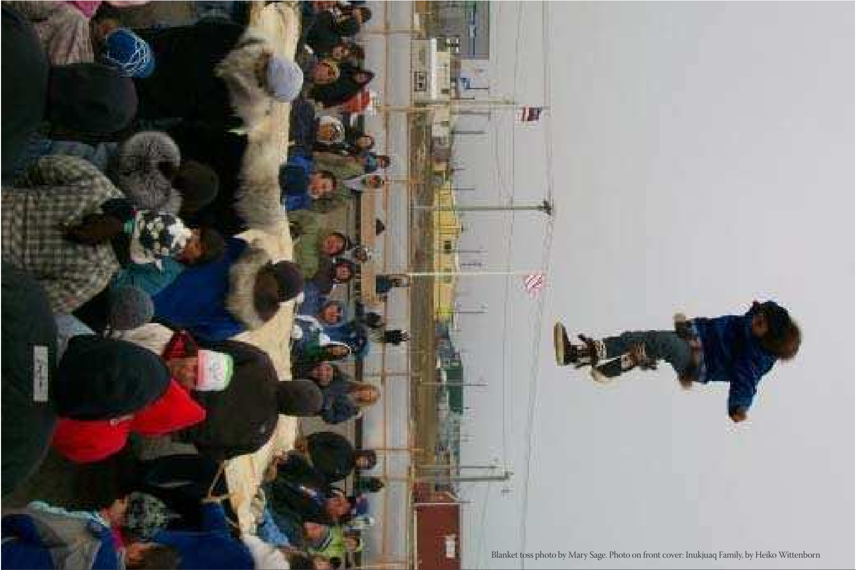
Blanket toss photo by Mary Sage. Photo on front cover: Inukjuaq Family, by Heiko Wittenborn