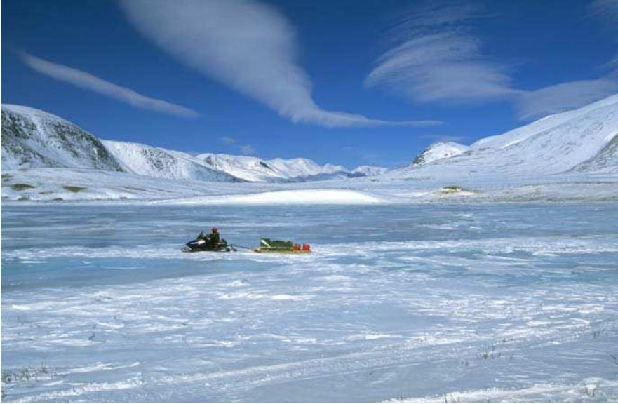
On the Land