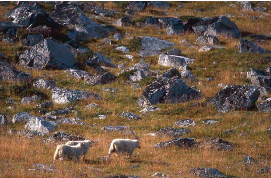
Sheep on the Rocks