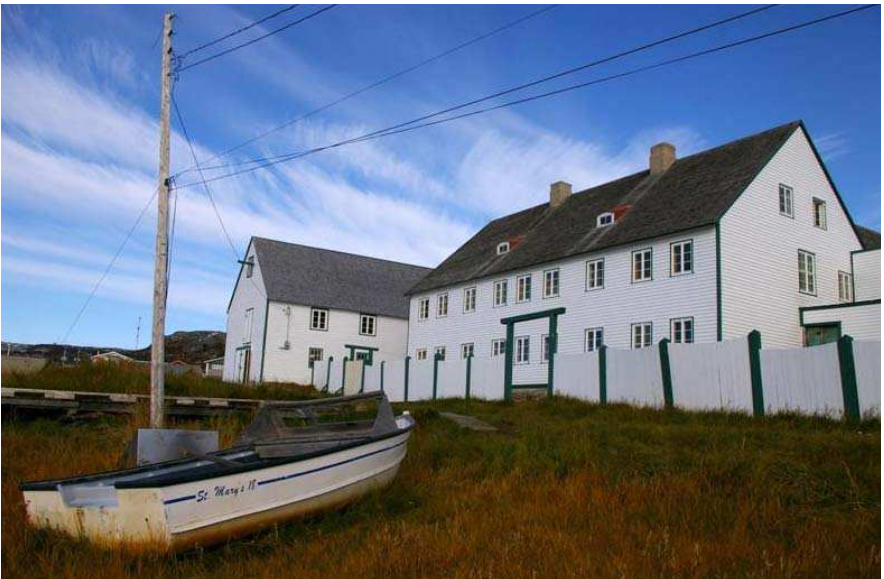
Hopedale Moravian Mission Labrador