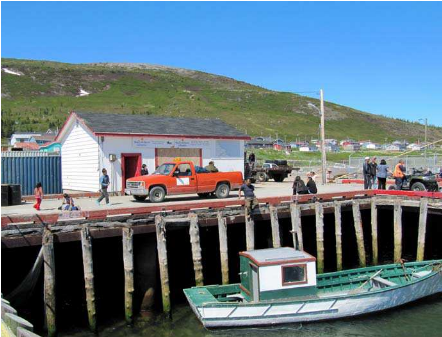
Nain Harbor Labrador