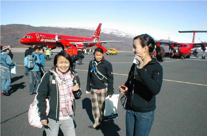
Flying is our Way