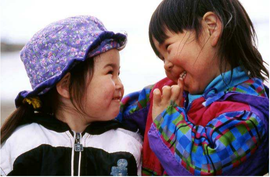
Girlfriends in Tasiujaq