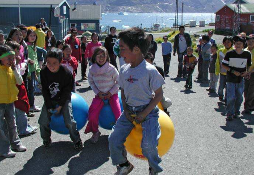
Elementary School Race