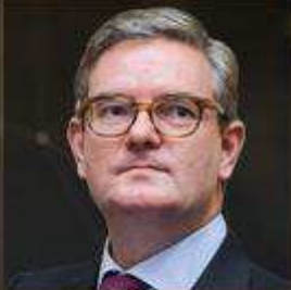
SIR JULIAN KING

European Commissioner for Security Union