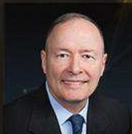
GEN (RET) KEITH ALEXANDER

Member, European Parliament; Former Chair, Global Commission on the Stability of Cyberspace