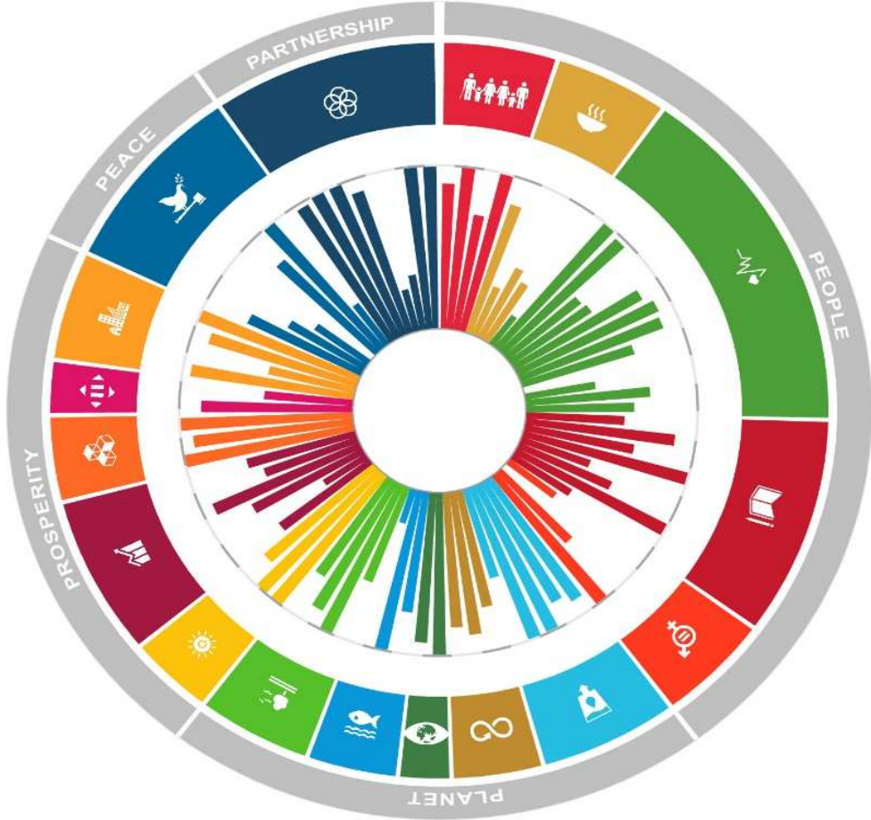
The chart shows current level of achievement on each available target. The longer the bars, the shorter the distance still to be travelled to reach 2030 target (dotted circle). Targets are clustered by goal, and goals are clustered by the “5Ps” of the 2030 Agenda (outer circle).