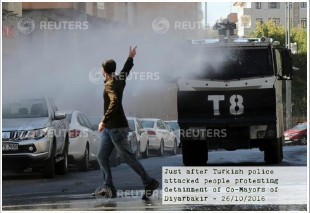
Just after Turkish police attacked people protesting detention of Co-Mayors of Diyarbakir - 26/10/2016