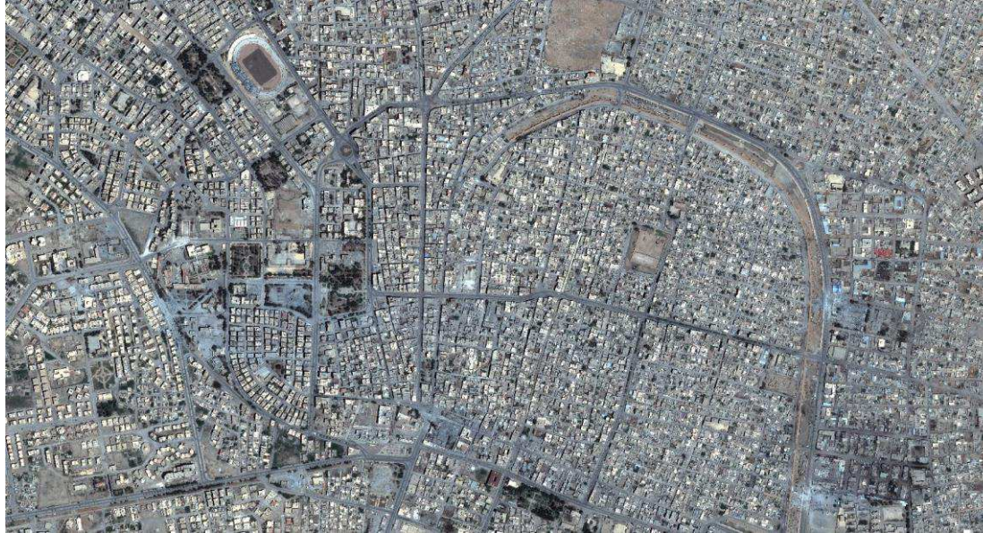
Raqqa Old City overview. Imagery taken on 2 June 2016.