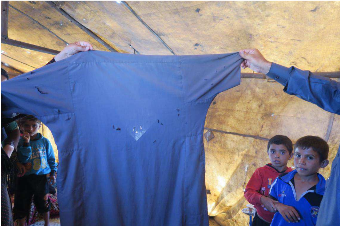
Survivors of cluster bomb attack by Syrian government forces in displaced people's shelters south of Raqqa show Amnesty International clothes torn by cluster bomb shrapnel.

Amnesty International that the message was clear; they would be safe by the water. With the threat of imminent attacks on their towns and villages, residents fled, with many ending up in makeshift camps between the Euphrates and its subsidiary irrigation canals. However, those shelters too soon came under attack.