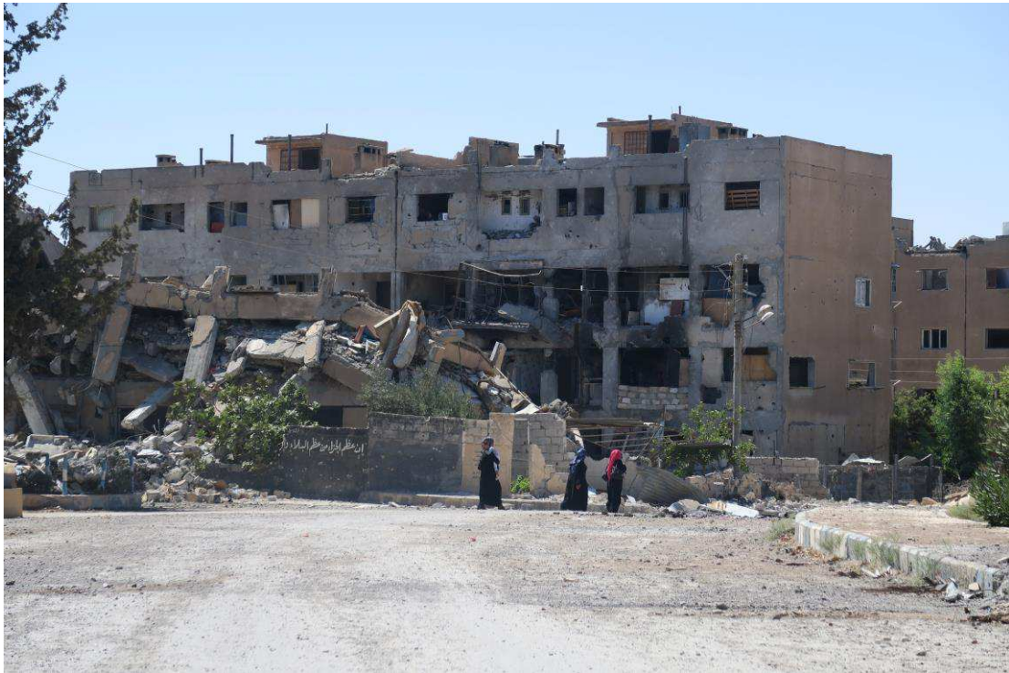
Families displaced by the conflict in Raqqa look for shelter in abandoned apartments in damaged and unsafe buildings in nearby towns previously recaptured from ISIS.

Notwithstanding these challenges, and in fact because of them, it is imperative that all the parties to the conflict take all feasible precautions to minimize harm to civilians; fully comply with the rules of international humanitarian law in the planning and execution of strikes and attacks - including by cancelling attacks that risk being indiscriminate, disproportionate or otherwise unlawful, and ending the use of explosive weapons with wide area effects in populated civilian areas, in compliance with the prohibition on indiscriminate or disproportionate attacks.