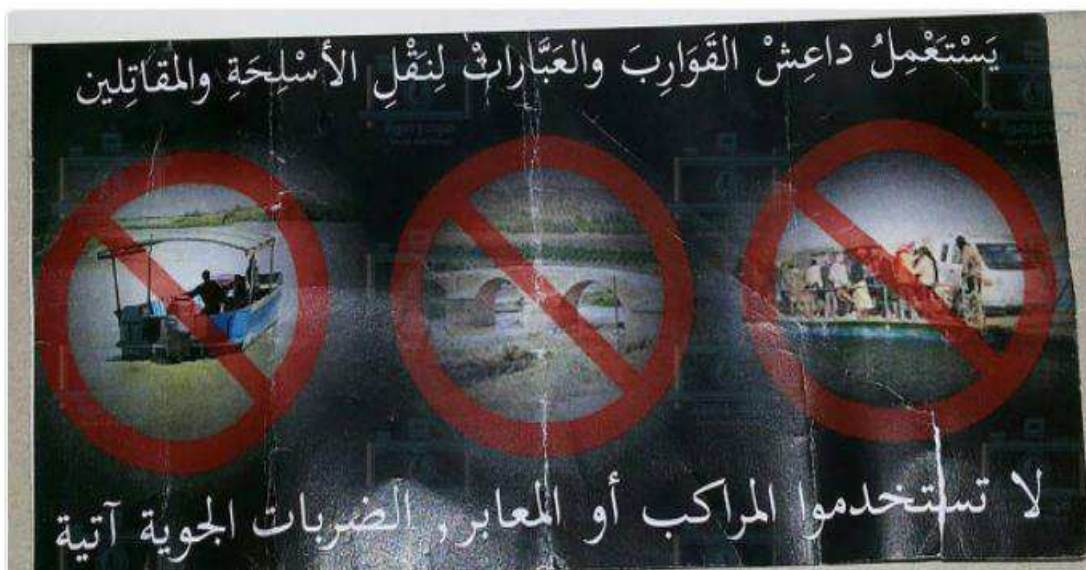
Leaflets dropped by the Coalition over Raqqa in March 2017.