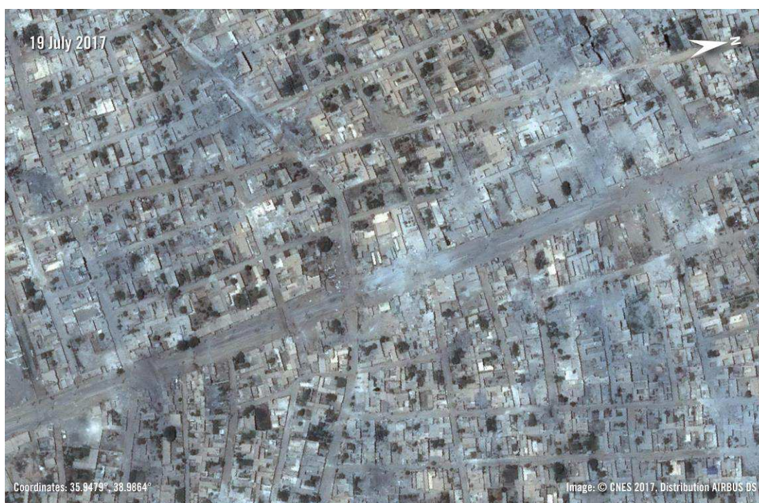
Raqqa, Ihsewa crossroad area. Imagery taken on 19 July 2017 after a series of strikes launched on 9 June. Coordinates: 35.9479°, 38.9864°.

It all happened in the space of a few minutes, sometime between 1 and 2pm, the shells struck one after the other. It was indescribable, it was like the end of the world – the noise, people screaming. If I live a 100 years I won't forget this carnage. Artillery shells are hitting everywhere, entire streets. It is indiscriminate shelling and kills a lot of civilians". 21