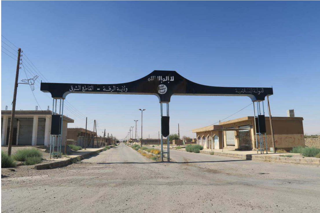
Leftover of so-called "Islamic State caliphate" east of Raqqah, now deserted.

Those who cannot afford to pay smugglers have one of two choices: either stay at home and risk being bombed or getting caught in the crossfire, or attempt to leave on their own and by so doing facing an even greater level of risk being killed by IS fighters or by the IS' mines and booby-traps.