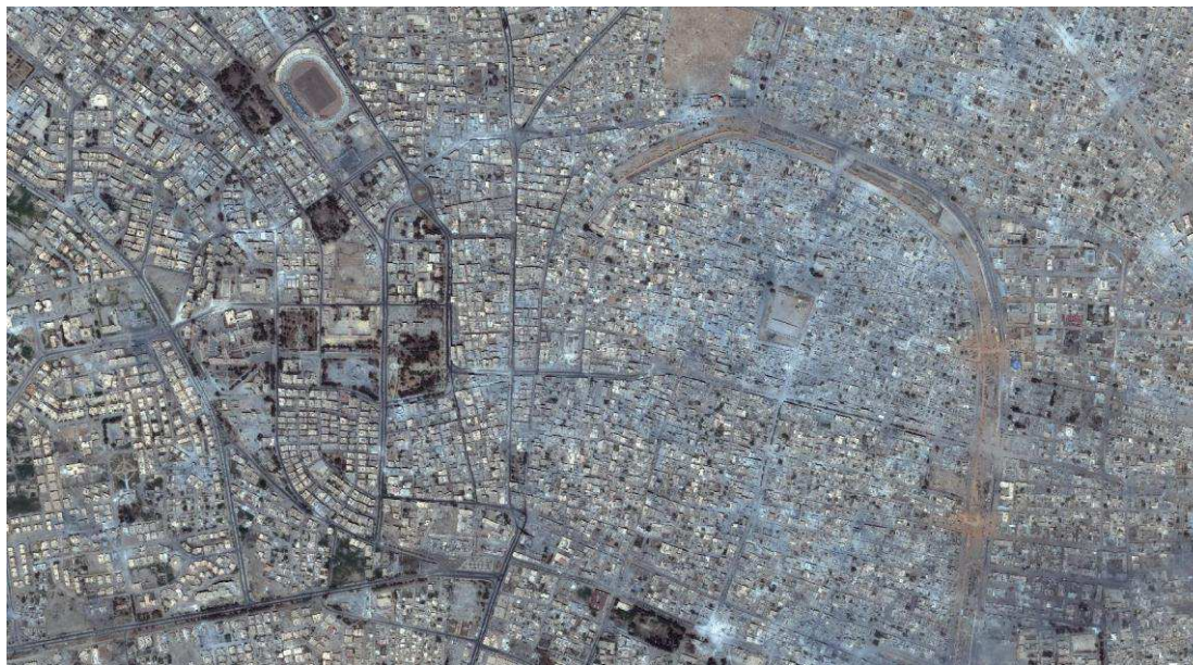
Raqqa Old City overview. Imagery taken on 19 July 2017.

IS fighters, for their part, use crude unguided projectiles, including locally manufactured mortars, and a host of improvised explosive devices (IEDs), including car bombs, all of which pose an inherent lethal danger to civilians. Moreover, the danger for civilian residents of getting caught in crossfire between the warring sides is all the more acute as IS fighters have been redoubling efforts to prevent civilians from leaving the city, using them as human shields while they launch attacks against SDF and coalition forces from amongst the