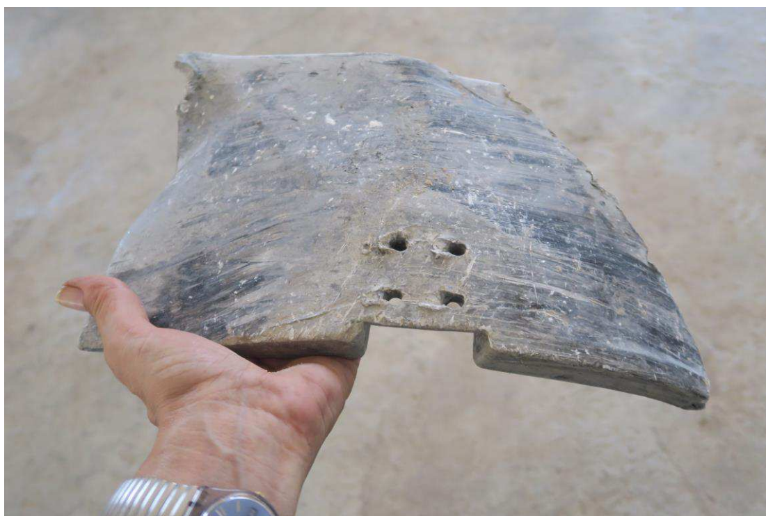
Fragment of a guidance fin from an American-designed Joint Direct Attack Munition (JDAM), which is a GPS-guided air-dropped bomb. From one of the bombs used in an air strike in Hukmya/Salhiya area northwest of Raqqa killed 14 members of a family and severely wounded two others on the evening of 11 May 2017. Eight of those killed in the attack were women and five were children. The two who were wounded were both children.

Amnesty International researchers visited the site and from the pattern of destruction there seems little doubt that the house was destroyed by air strikes. At the site, the organization’s researchers recovered a fragment which weapon experts identified as a guidance fin from an American-designed Joint Direct Attack Munition (JDAM), which is a GPS-guided air-delivered bomb. 29 It is however not clear why the house was targeted. According to the two survivors of the strike, two children aged 14 and 15, no one was in the house other than the family members who lived there – eight women, seven children and one man. Amnesty International could not establish whether IS fighters might have been hiding in or launching attacks from the fields around the house before/at the time of the strike. However even if this was the case, it would not have constituted ground for targeting a house full of civilians.