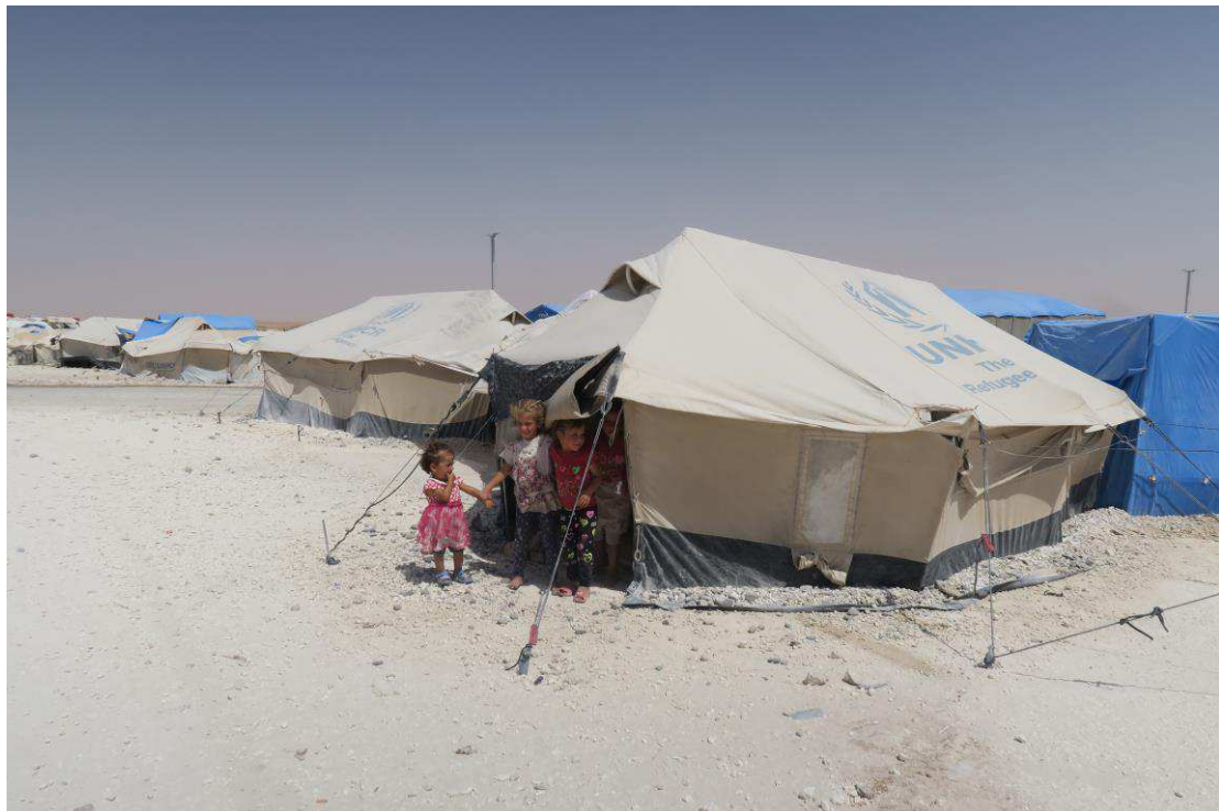
Children displaced by the battle in Raqqa sheltering in IDP camp in Ain Issa, northern Syria.

Syrian government forces lost control of Raqqa City to armed opposition groups including Ahrar al Sham and Jabhat al-Nusra in early March 2013, making Raqqa the first Syrian provincial capital from which government forces were expelled entirely since the beginning of the uprising in 2011. 9 After a brief power struggle with other armed groups, by the end of 2013 the IS had taken full control of the city, 10 which it held until June 2017, when the ongoing military operation to recapture the city was launched by the SDF and US-led coalition forces.