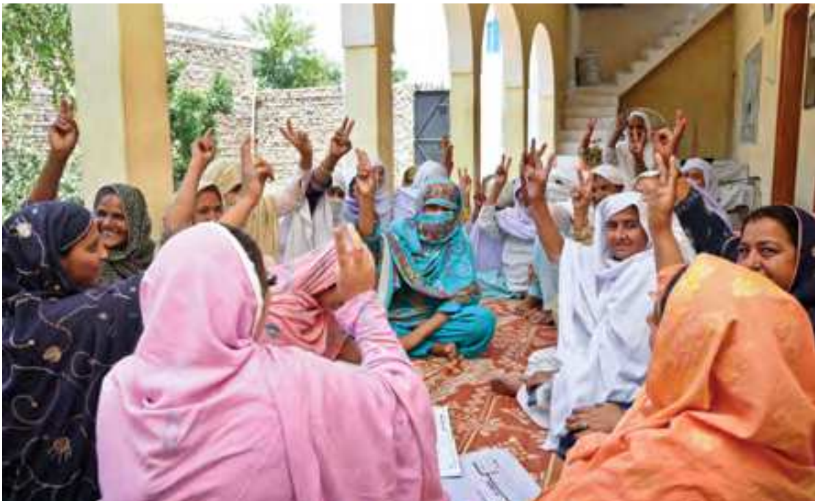
UNDP Pakistan Meeting of female community organization "Shamatanzeem" village "Padhana", and union council "Dheenda" of district Haripur. Discussing general issues.

Below are some ways that a parliament can take specific action to ensure SDG implementation is done in coordination with sub-national and local governments and with the input of people throughout the country.