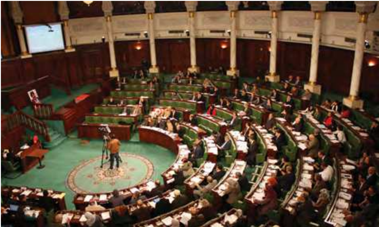
UNDP Tunisia Debates of the Tunisian Constitution, 20th January 2014.

Ideally, proposed draft laws dealing with development-related issues will explicitly identify whether and how they support Agenda 2030 and specific SDGs and their targets. This could be included in the explanatory memorandum to the draft law and in the speech introducing the draft law. Currently, however, this is not common practice. To address this, parliaments themselves may wish to commission an SDG Impact Analysis from their own parliamentary secretariats to identify how the proposed draft law impacts on SDG achievement. Alternatively, the rules of procedure can be amended to require the sponsor of the law to produce such an analysis when the draft law is introduced. Some countries already undertake socio-economic, environmental, and gender impact assessments of draft laws. Lessons learned indicate that such a process can be systematized through the adoption of a simple checklist, which can then be applied by the parliamentary secretariat to each draft law produced for consideration. Parliamentarians can then use this information to identify areas for amendment.