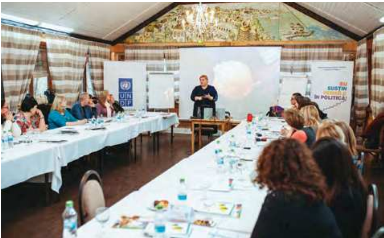
UNDP Moldova Parliament Secretariat pledges to promote a gender-responsive human resources management on 23rd November 2016.

To get from here to there, as mentioned earlier, all parliaments will need to build new capacities. Even if your parliament is actively engaging public and seeking their feedback through the work of members and committees; even if your parliament has the capacity to conduct in-depth research and has in place systems that allow people's voices to be actively expressed through parliamentarians; there will still be a need to reflect on how your systems must be retooled to ensure they will advance the 17 SDGs.