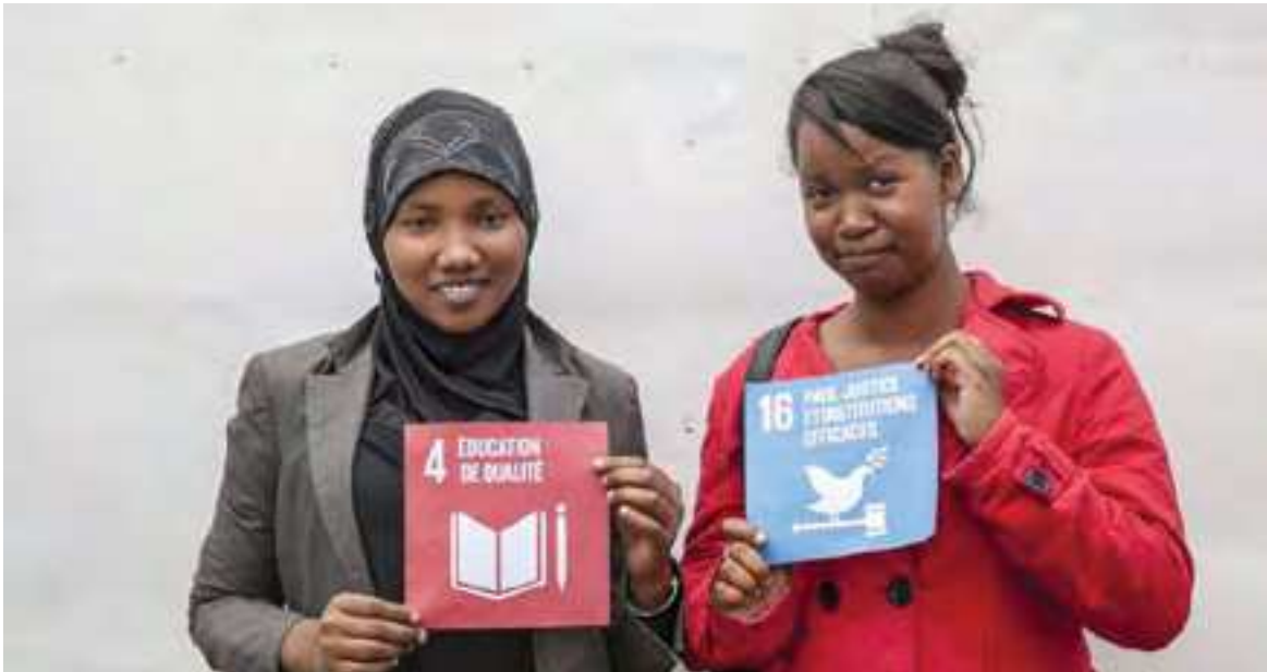
UNDP Madagascar Youth raise Global Goals at Social Good Summit in Madagascar on September 2015