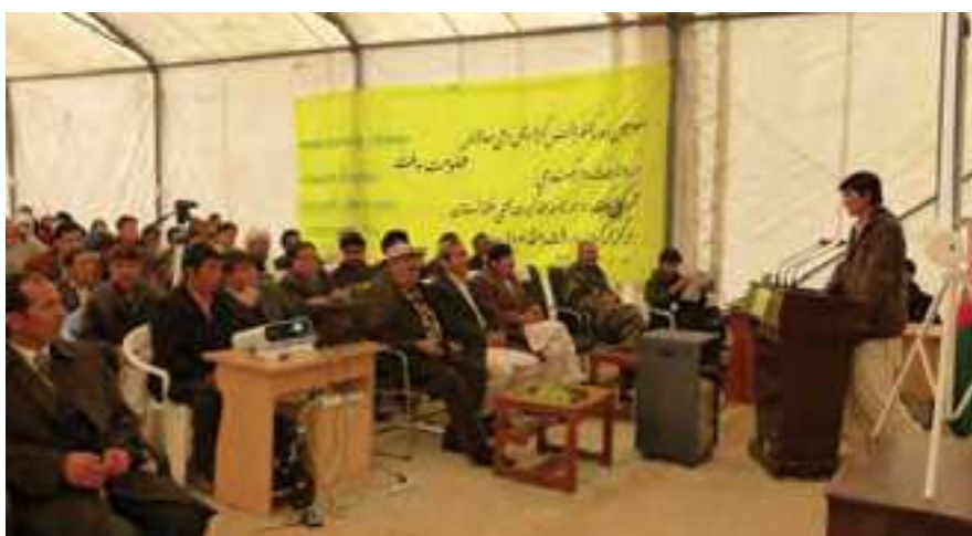
UNAMA Third Dai Kundi Annual Reporting Conference in Afghanistan on January 2012.

Public consultations: As noted in Section VI above, parliamentary committees should be engaging civil society and the public as they consider draft laws and conduct inquiries. Such consultations can range from the informal (such as public forums and reporting sessions) to the more formal (e.g., public hearings); and from the technical (e.g., surveys) to the simple (e.g., requests for submissions via SMS). Consultation can also come in the form of virtual engagement, including online feedback, surveys and social media.