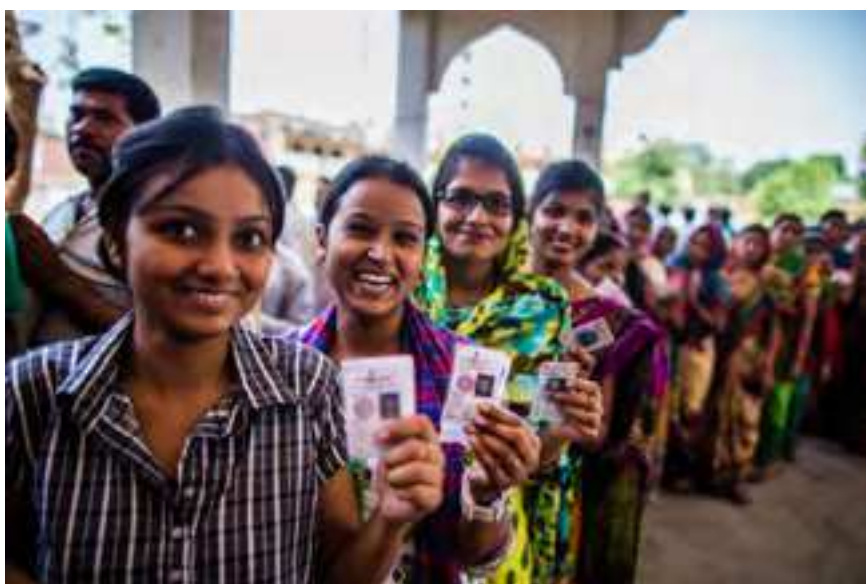
UNDP India India elections 2014.

tasking an existing committee to undertake a specific inquiry into an issue. If there is no committee with subject matter jurisdiction, or when an inquiry may require more dedicated resources, a parliament may also choose to establish an ad hoc or special committee with a specific, singular mandate to undertake an inquiry and then disband upon completion of its work.