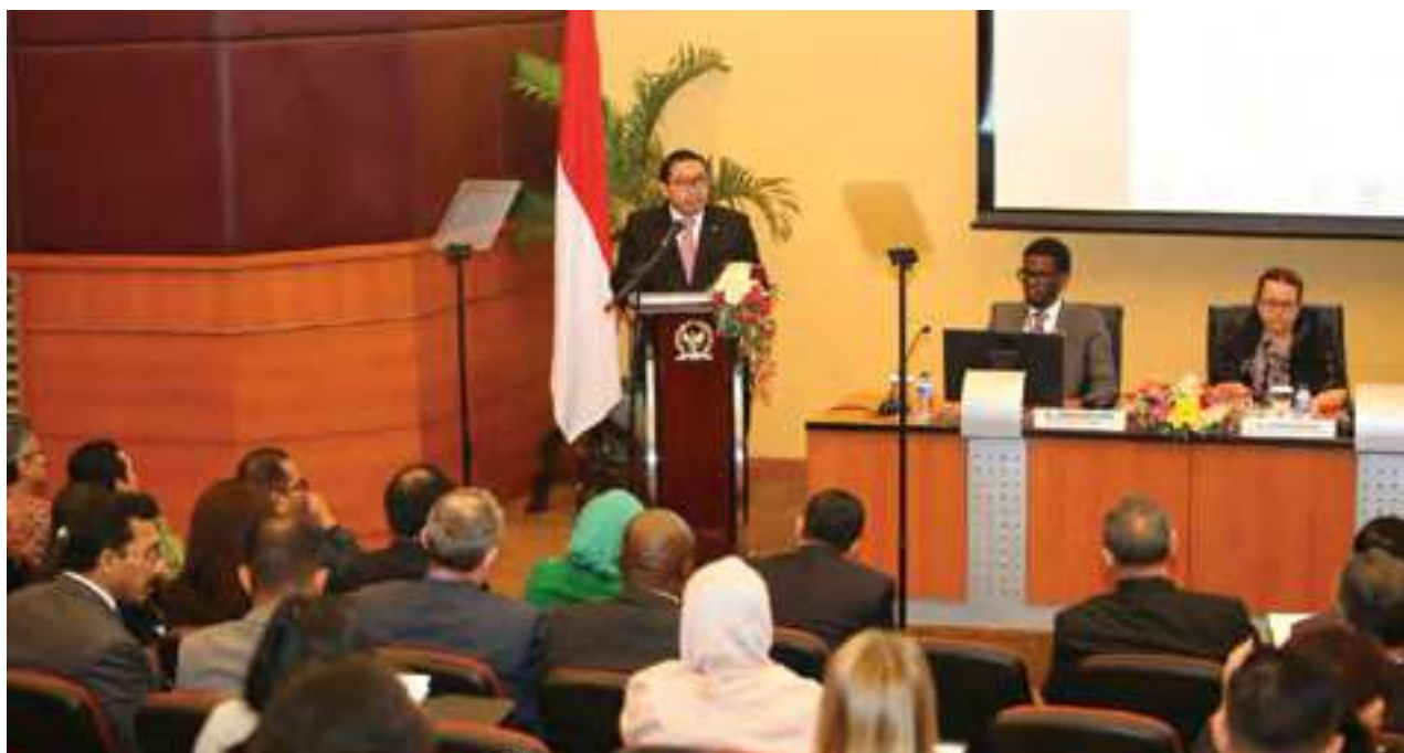
Regional Workshop on Parliaments and SDGs, 30 to 31 August 2016, Jakarta, Indonesia.

It is important for parliaments and parliamentarians to know that they are not alone in their efforts to monitor SDG implementation to achieve key development objectives. Many regional and global organizations work to promote the achievement of one or more of the SDGs. Some of these groups may already be engaged with your parliament; if not, they can be engaged to support the work of parliamentarians and parliament to build capacity and support your efforts to be a full and active partner in the implementation of the SDGs in your country.