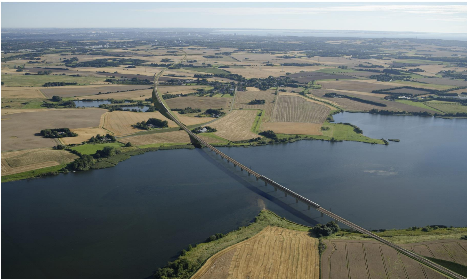
Visualisering af løsning