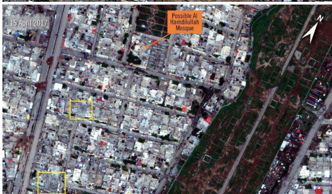
In al-Resala, west Mosul, images show the area around the possible al-Hamdilullah Mosque. Two areas, highlighted with yellow boxes, appear destroyed in imagery from 15 April 2017.