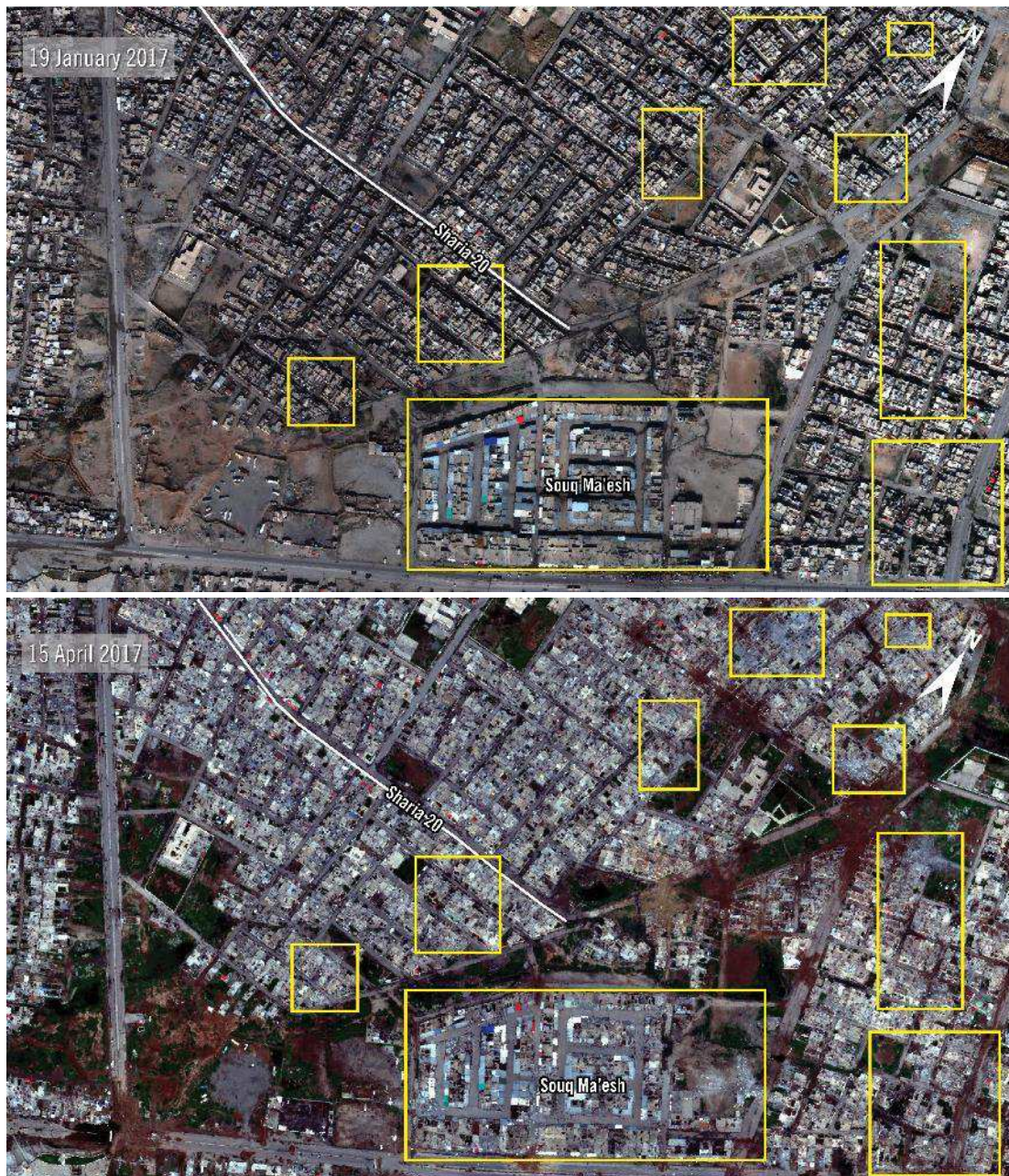
Major damage is visible in the al-Tenak neighbourhood near Souq Ma'esh between 19 January 2017 and 15 April 2017. Areas with significant damage are highlighted with yellow boxes.