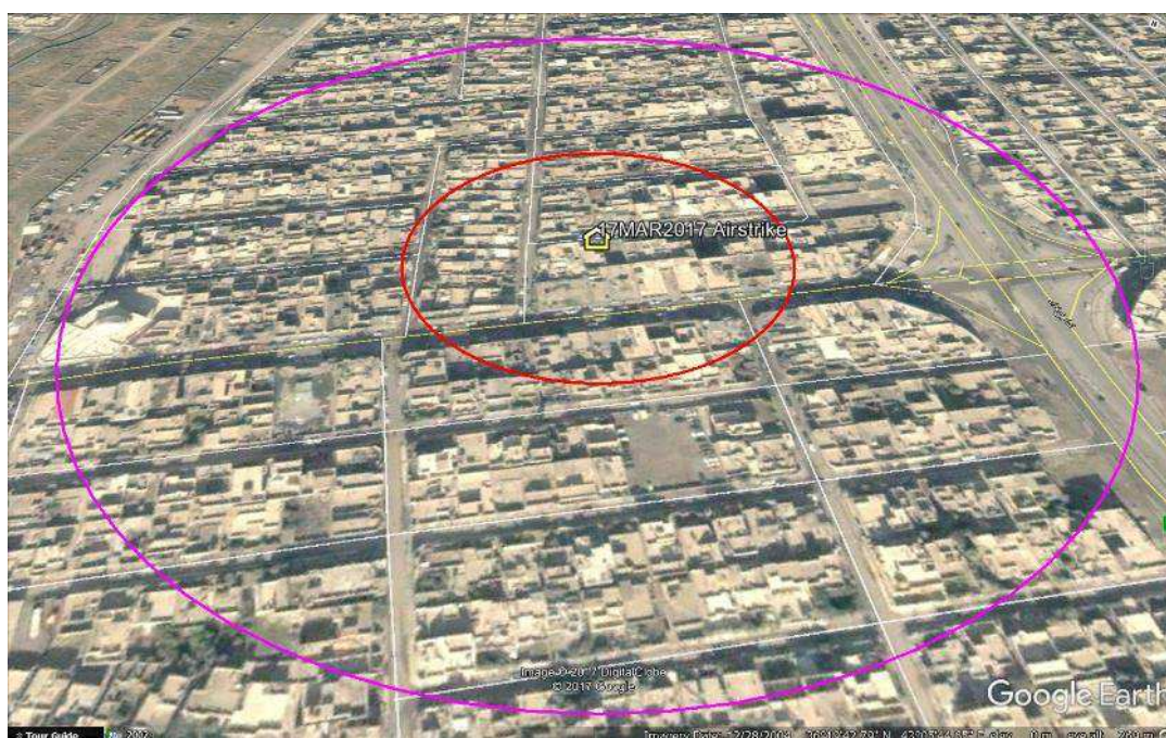
17 March 2017. The Red Ring marks an area of 102m. This is the area where the overpressure from a GBU-38 is hazardous to people outdoors. Purple ring marks an area of 245m. This is the area affected by hazardous fragmentation from a GBU-38.