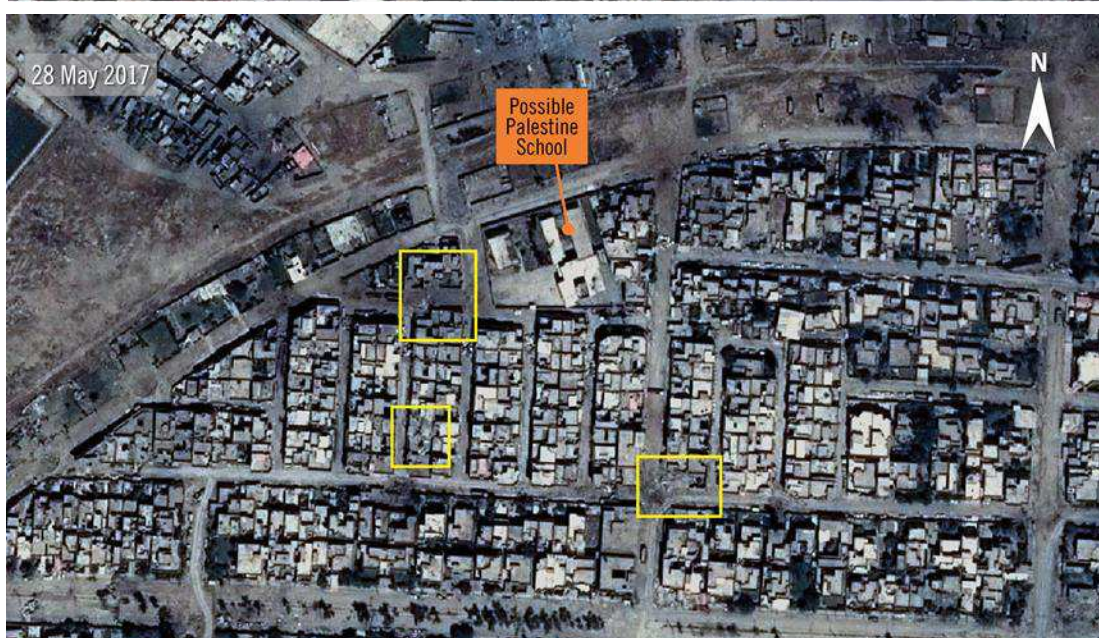
Between 00 April 2017 and 28 May 2017, imagery shows al-Tharwa neighbourhood around a building likely to be the Palestine School. Damage and collapsed buildings – highlighted with yellow boxes – are visible in three locations near the possible school.