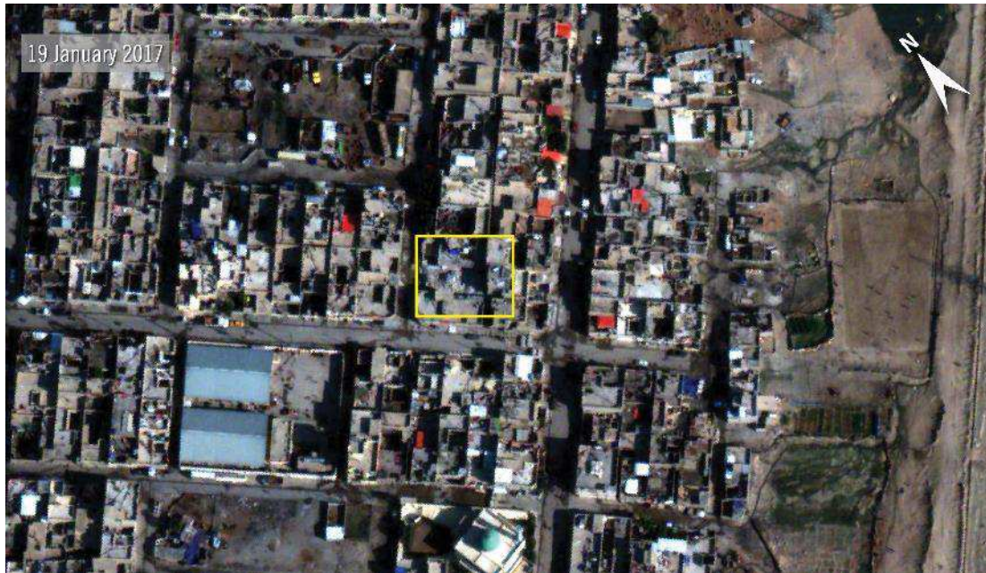
Before the major assault on west Mosul began, an area in al-Shuhada neighbourhood shows signs of damage and destruction in imagery from 19 January 2017. Structures appear collapsed with other damage probable in the vicinity since there is such a high density of buildings in the area.

According to the witnesses, this strike killed one IS target at a cost of 40 civilian lives. 101 Based upon the information available, this attack should be investigated as a possible disproportionate attack.