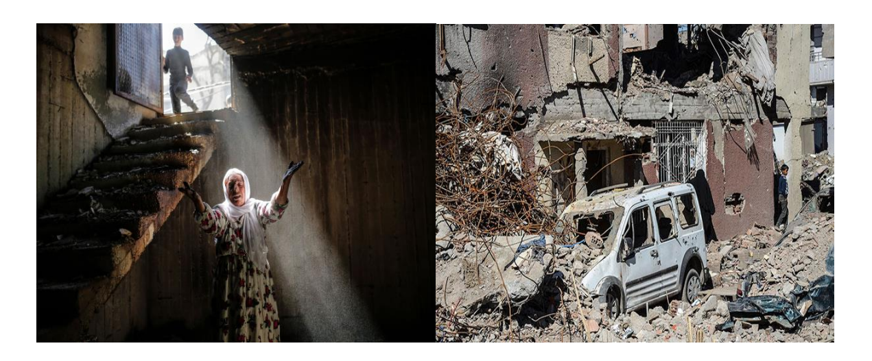
Financial Times: The Financial Times published pictures of Cizre under the heading of "In the ruins of Cizre". Others preferred the title "The Second Kobane".