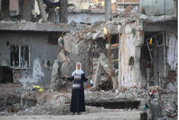
<u>Turkish journalist</u>: Renowned Turkish journalist Cengiz Candar likened what happened in Cizre to the situation in Dresden after it was bombed in 1945 towards the end of the war: