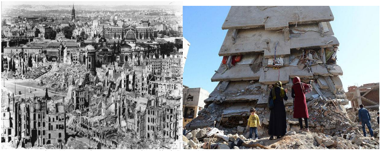
From Dresden 1945 to the "graveyard" called Cizre 2016...