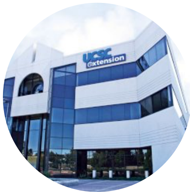
UC SANTA CRUZ