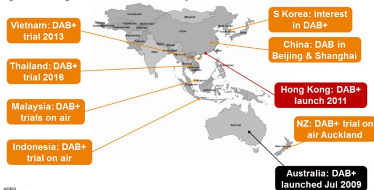
Figure 2: Digital radio in Asia Pacific

In Asia Pacific, a similar pattern is emerging. Australia successfully launched DAB+ in 2009, followed by Hong Kong in 2011. Several other markets, including Thailand, Malaysia, Indonesia and Vietnam are now investigating digital radio options. WorldDAB has organised workshops in each of these countries.