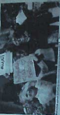
Children of refugees welcome their families in a camp in Germany.

Thousands of refugees are being welcomed in Germany, with many families reuniting after long separations. The arrival is marked by emotional scenes as loved ones are reunited in a safe haven.