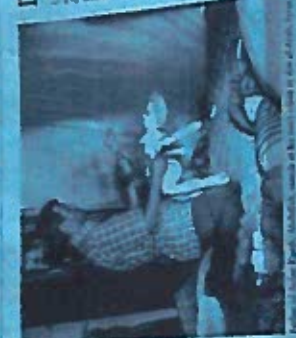
The bodies of two young Syrian boys who drowned in the Mediterranean Sea were found in a boat off the coast of Turkey.

Drowned Syrian boys' aunt fights to bring family to Canada The aunt of two young Syrian boys who drowned in the Mediterranean Sea is fighting to bring their family to Canada. She says she has been denied entry to the country because of her status as a refugee.