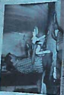
A person sitting on the ground in a camp, possibly a refugee.

Thousands of refugees are being welcomed in Germany, with many families reuniting after long separations. The arrival is marked by emotional scenes as loved ones are reunited in a safe haven.