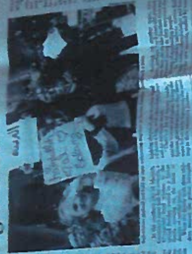
Students in private boarding schools in the Middle East and elsewhere have been protesting against the Syrian conflict.

Germany The German government has announced that it will accept a special return centre for rejected asylum seekers from Denmark as a condition for allowing more Syrian refugees to enter the country.