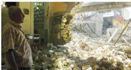
An Iraqi man inspects the damage at a Christian Catholic Church after double attacks in central Kirkuk, northern Iraq on 15 August 2011.

The EU's delegation within Iraq remains woefully small, under-resourced, and under-staffed. More worrying is the complacent, or at worst disengaged, attitude that seems to characterise the approach to Iraq from the European Commission, and newly formed EEAS. The EU has projected itself as an international actor and has been