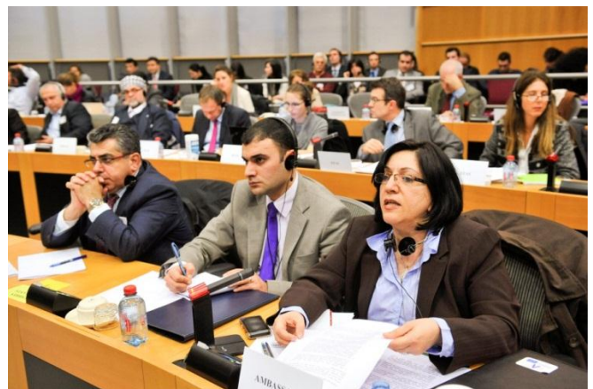
Representatives from the Iraqi Embassy in Brussels