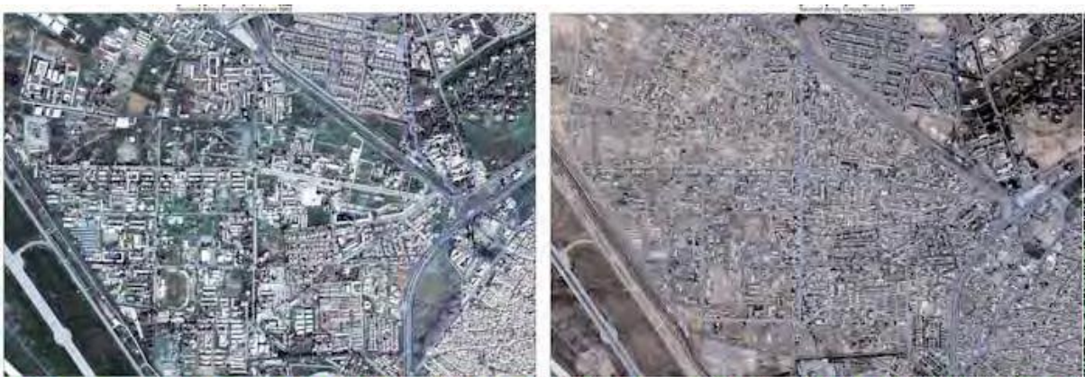
Part of the eastern border of Kerkuk city Satellite Map of Kerkuk province the Map of 2002 compared with the map of 2007