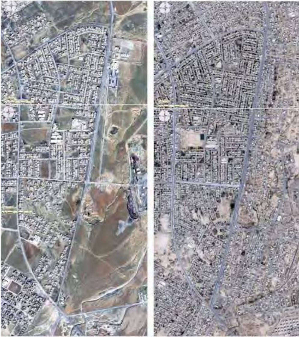
Part of the eastern border of Kerkuk city Satellite Map of Kerkuk province the Map of 2002 compared with the map of 2007