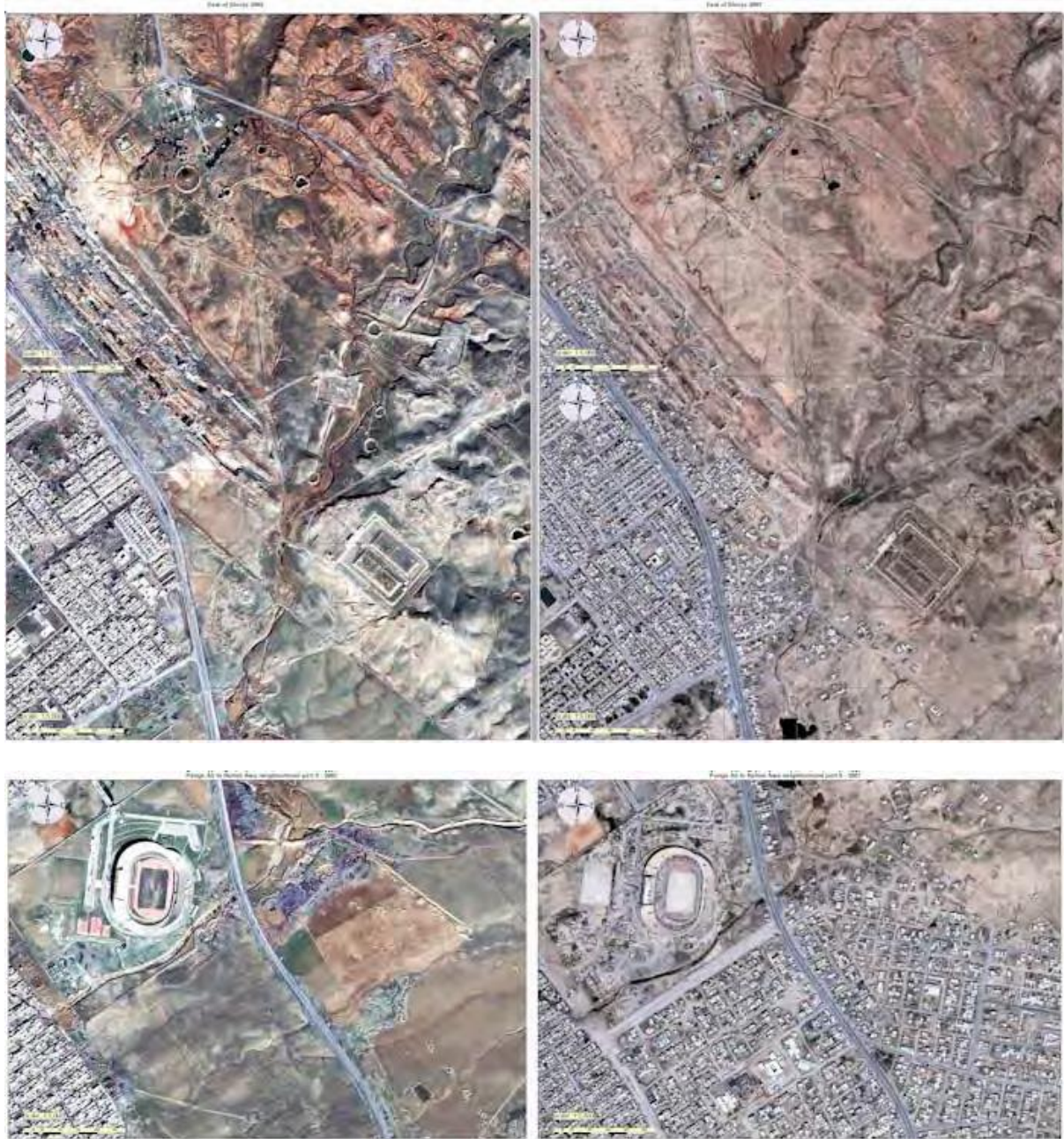
East of Shorja neighbourhood Satellite Map of Kerkuk province the Map of 2002 compared with the map of 2007