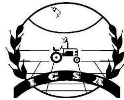
International Council for Sustainable Agriculture (ICSA)