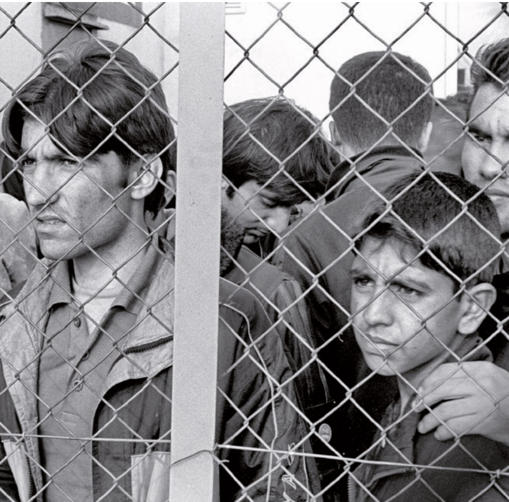
Asylum-seekers and migrants held in the Fylakio Detention Centre, Evros Region, northern Greece, October 2010.

migrants conducted in August. In the Elliniko detention facilities, conditions amounted to inhuman and degrading treatment. In both the New and Old Elliniko detention facilities, bedding was old and dirty, toilets were filthy and detainees had access to poor quality drinking water. Those held at Old Elliniko had no access to outside exercise and no natural light reached their cells.