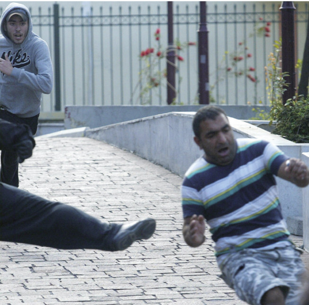
Above left: A racist attack on a migrant in the centre of Athens, Greece, 12 May 2011. The group wear Greek flags and carry a variety of improvised weapons.