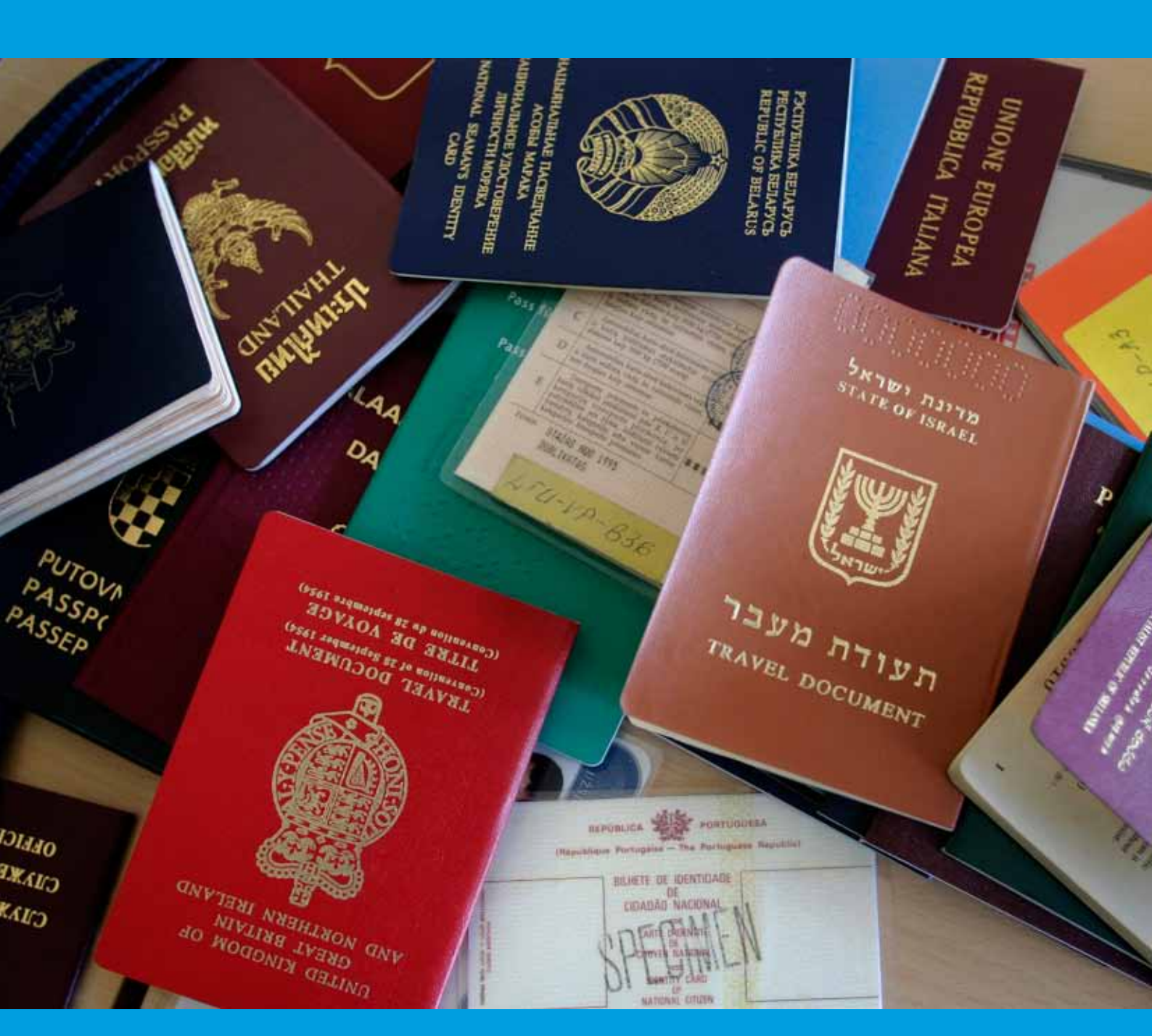
A variety of passports used as props at the Medininkai Border Guard School in Lithuania, where students learn to distinguish between real and fake passports. The students here will work along the border between Lithuania and Belarus.