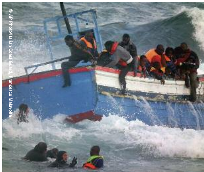
Italian Coast Guard scuba divers, seen bottom left, rescue migrants in Pantelleria, Italy, 13 April 2011. Officials say two women drowned while attempting to reach Italy from North Africa after their boat with 250 people aboard went off course and ran aground just off an Italian island.

States must be held accountable for the human rights abuses committed in the context of externalization. A lack of transparency surrounding many European countries’ border management practices and agreements with third countries means that the violations continue unchecked. In the permissive environment created by this lack of scrutiny, migrants, refugees and asylum-seekers are denied any protection of their rights.