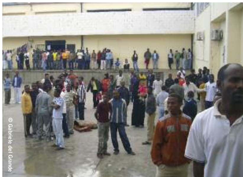
Refugees and migrants in the yard at Misratah Detention Centre, Libya, November 2008.

Research by Amnesty International and other human rights groups has exposed widespread abuses against refugees, asylum-seekers and irregular migrants in Libya during Colonel al-Gaddafi’s rule, as well as during and following the conflict that deposed him. 4 Documented violations and abuses include indefinite detention in extremely poor conditions, beatings and other ill-treatment, in some cases amounting to torture. Refugees and asylum-seekers also face a real risk of refoulement (being returned to a country where they are at risk of persecution or serious human rights abuses). Libya is not a party to the 1951 UN Convention relating to the Status of Refugees and its