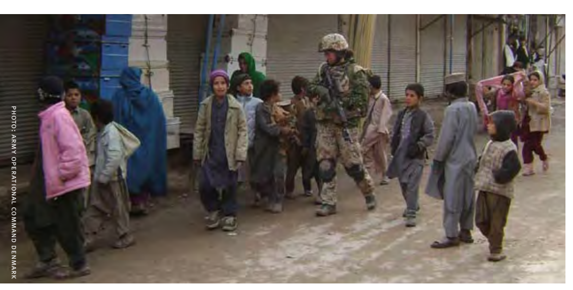
Danish women soldiers are actively involved in Denmark's peace-keeping efforts in Afghanistan.