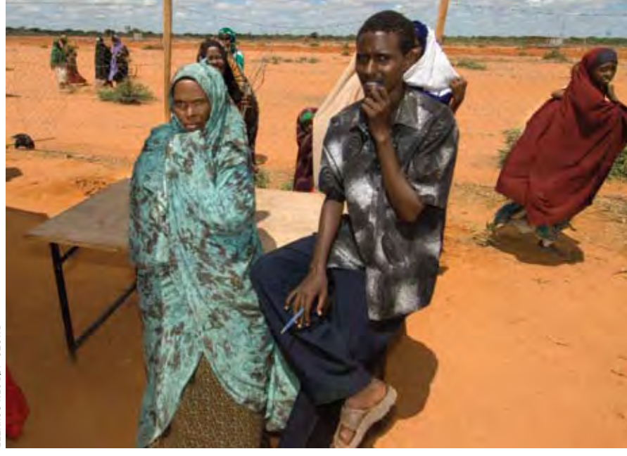
Somali-refugees surviving in refugee camps in Kenya.

Within the United Nations, Denmark proactively works on human rights, peace and conflict responses. Denmark has been a staunch and active supporter of the work of the UN High Level Panel on Threats, Challenges and Change. Denmark regards the setting up of the UN Peace Building Commission as a major achievement of the ongoing UN