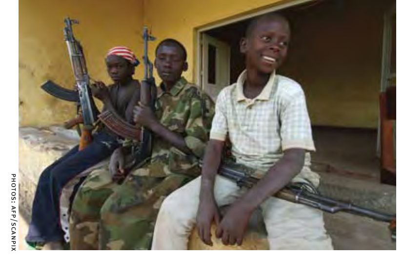
Former child soldiers, mostly young boys, constitute a special problem in post-conflict reconstruction.

The Peace Building and Conflict Prevention chapter (chapter 4), is divided into three sub-sections: the first sub-section lists the actions relevant to bilateral and regional cooperation, the second sub-section includes humanitarian and NGO assistance and the third is on multilateral engagement.