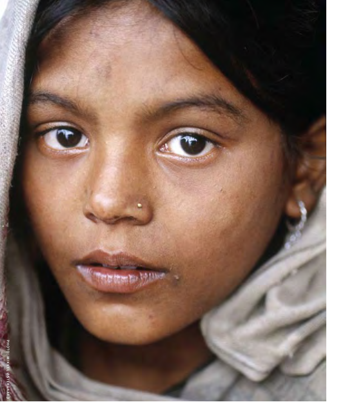
Young girls in Nepal join groups to learn about women's rights.