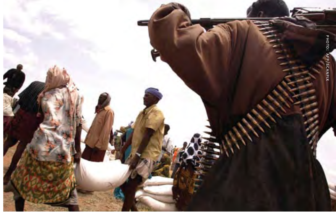
Various aspects of SCR 1325 are included in the humanitarian activities of organisations such as World Food Programme.

The Danish Armed Forces and the Danish National Police will enhance staff competence and understanding in international operations of local cultural conditions, as well as the social and