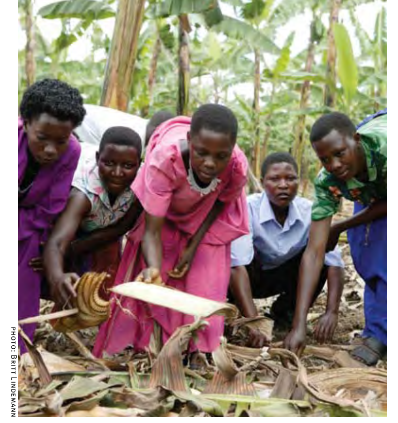
Women are to participate in all decisionmaking processes, and at all levels.

used as a forum to exchange views and discuss progress and experiences with implementation.