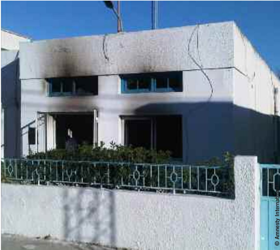
Burned police station at Ariana, north of Tunis, January 2011.