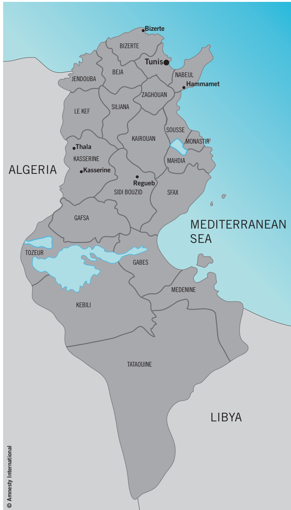
Map of Tunisia showing governorates (regions) and selected towns.