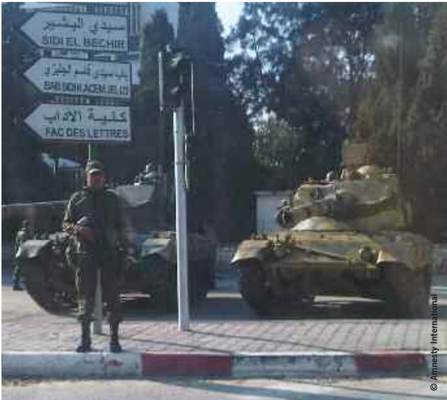
Army patrolling the streets of Tunis, January 2011.