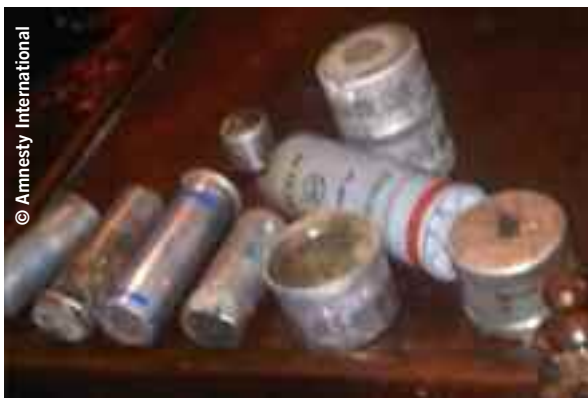
Left: Tear gas canisters collected in Thala during the unrest in January 2011.

After several days of silence, the first official response came on 28 December, when President Zine El Abidine Ben Ali visited the dying Mohamed Bouazizi in hospital and made a statement promising to address some of the protesters' socio-economic demands. However, he also warned that the law would be firmly enforced against the "extremists and agitators". 8