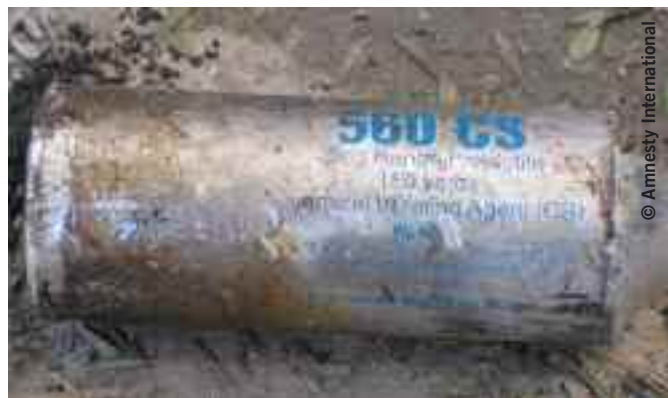
Right: CS gas cartridge at the corner of Carthage Avenue and Oum Kalthoum Street, Tunis, 15 January 2011.

The law he was possibly referring to – Law No.69-4 of 24 January 1969 regulating public meetings, processions, parades, demonstrations and gatherings – stipulates that the authorities must be informed before such an event takes place, which they can then forbid if they deem it likely to disturb the peace. In practice, this meant that anti-government protests were not tolerated under the presidency of Zine El Abidine Ben Ali. In the rare instances when protesters defied the repressive legislation, such as in Gafsa in 2008, they were met with excessive use of force, arbitrary arrests and detention, and unfair trials.