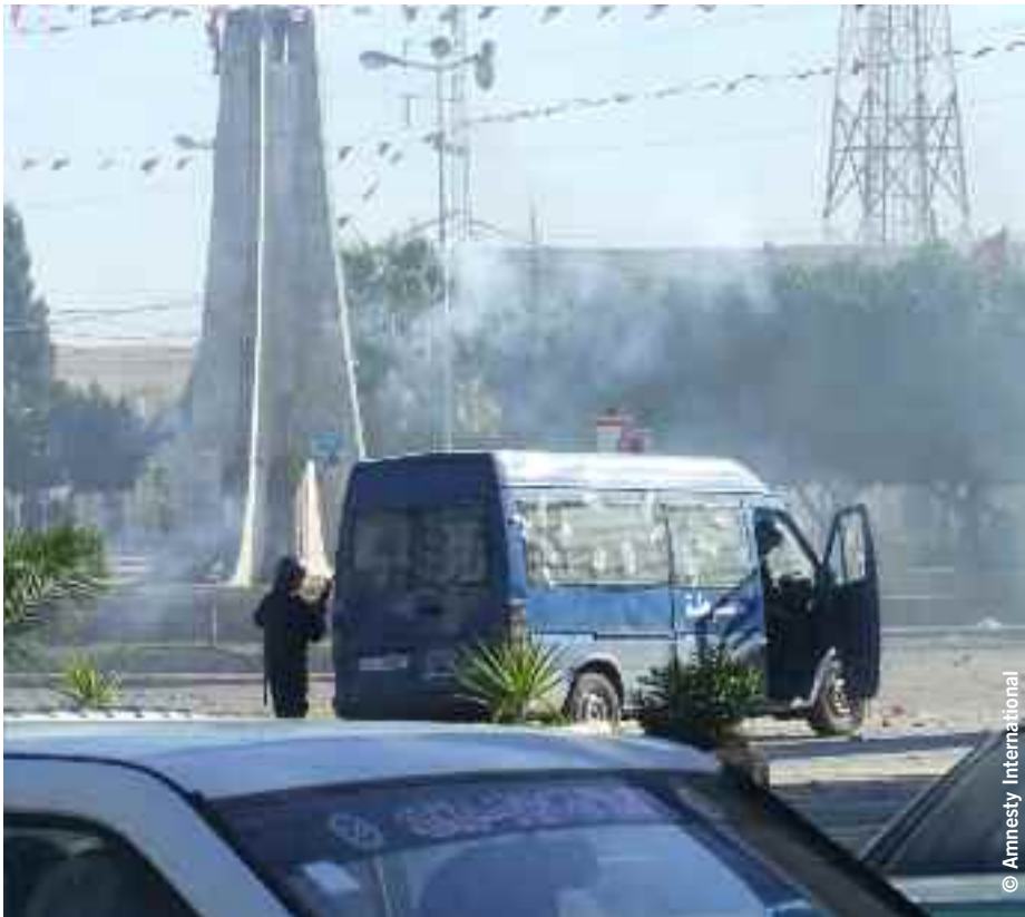
Security forces across the country used tear gas, rubber bullets and live ammunition against protesters. In Regueb, pictured left , five people were killed by gunfire.

In other protests in the city, security forces not only used live ammunition when it was not strictly necessary to save lives, but also beat protesters, including minors. For instance, on 4 January, security forces prevented students from the local college in Thala from protesting outside their school. According to a teacher present at the time, security forces closed the gates of the school and beat the 15-year-old children over a period of around two hours. They also fired tear gas at the students. An ambulance driver, who was trying to reach the school to provide medical assistance to the children, told Amnesty International that security forces stopped him from passing through the school gates, a further violation of the rights of these children.