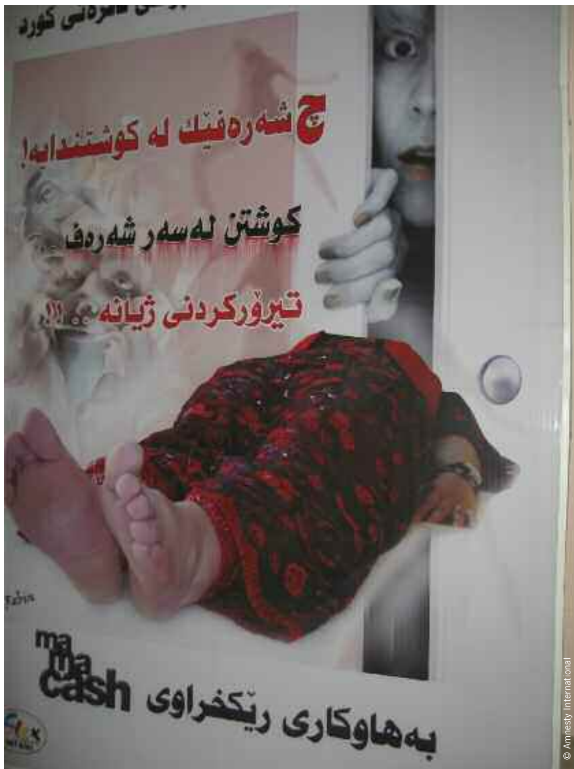
Poster by the Kurdish women's organization Khatuzeen, campaigning against "honour killings".