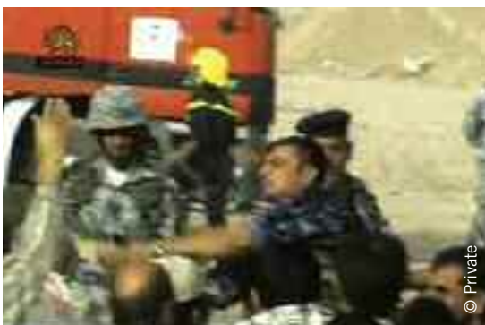
Iraqi police and security forces confront residents in Camp Ashraf, July 2009.

Several Iraqi refugees who had returned to Iraq or intended to do so imminently, told Amnesty International that their decision was driven by their lack of resources or that they could not legally reside in a host country.