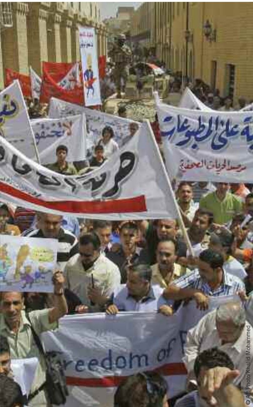
Demonstrators in Baghdad demanding freedom of the press, August 2009.

notably by members of Islamist armed groups and militias. Some have been attacked and killed because of their efforts to promote gender equality.