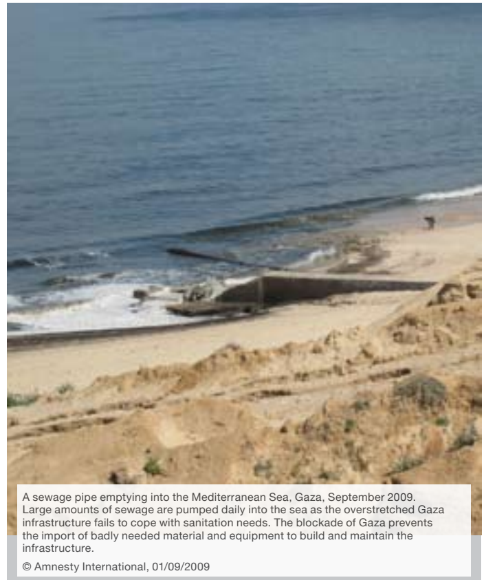
A sewage pipe emptying into the Mediterranean Sea, Gaza, September 2009. Large amounts of sewage are pumped daily into the sea as the overstretched Gaza infrastructure fails to cope with sanitation needs. The blockade of Gaza prevents the import of badly needed material and equipment to build and maintain the infrastructure.

The worsening situation has increased dependence on medical assistance outside Gaza; but here again the blockade bites. The Israeli authorities at Erez Crossing often deny even seriously ill patients permission to exit Gaza for treatment in medical centres in the West Bank, East Jerusalem, Israel, or Jordan. 54 Between January and July 2009 an average of only 51% of patients applying for access to medical care via Erez Crossing were permitted to exit, while the handling of over a third of patient requests was delayed. These patients were not able to exit Gaza on time and missed at least one medical appointment; 73% were delayed for more than seven days. 55