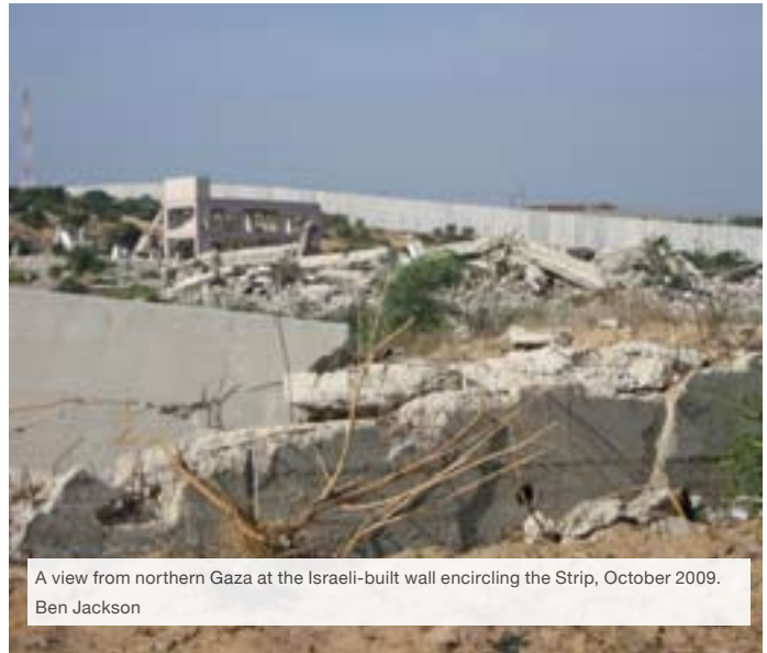
A view from northern Gaza at the Israeli-built wall encircling the Strip, October 2009. Ben Jackson

While Israel has a duty to protect its citizens, the measures it uses to do so must conform to international humanitarian and human rights law. Indiscriminate attacks by Palestinian armed groups in southern Israel, which have killed several civilians and injured dozens more, are a clear violation of international humanitarian law. We condemn such indiscriminate attacks against civilians. Abuses of international law by one side, no matter how serious, can never justify abuses by the other side. By enforcing the blockade on the Gaza Strip, Israel is violating the absolute prohibition on collective punishment in international humanitarian law, 67 punishing the entire population of Gaza for the acts of a few.