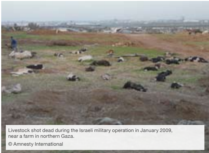
Livestock shot dead during the Israeli military operation in January 2009, near a farm in northern Gaza.