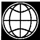
The World Bank