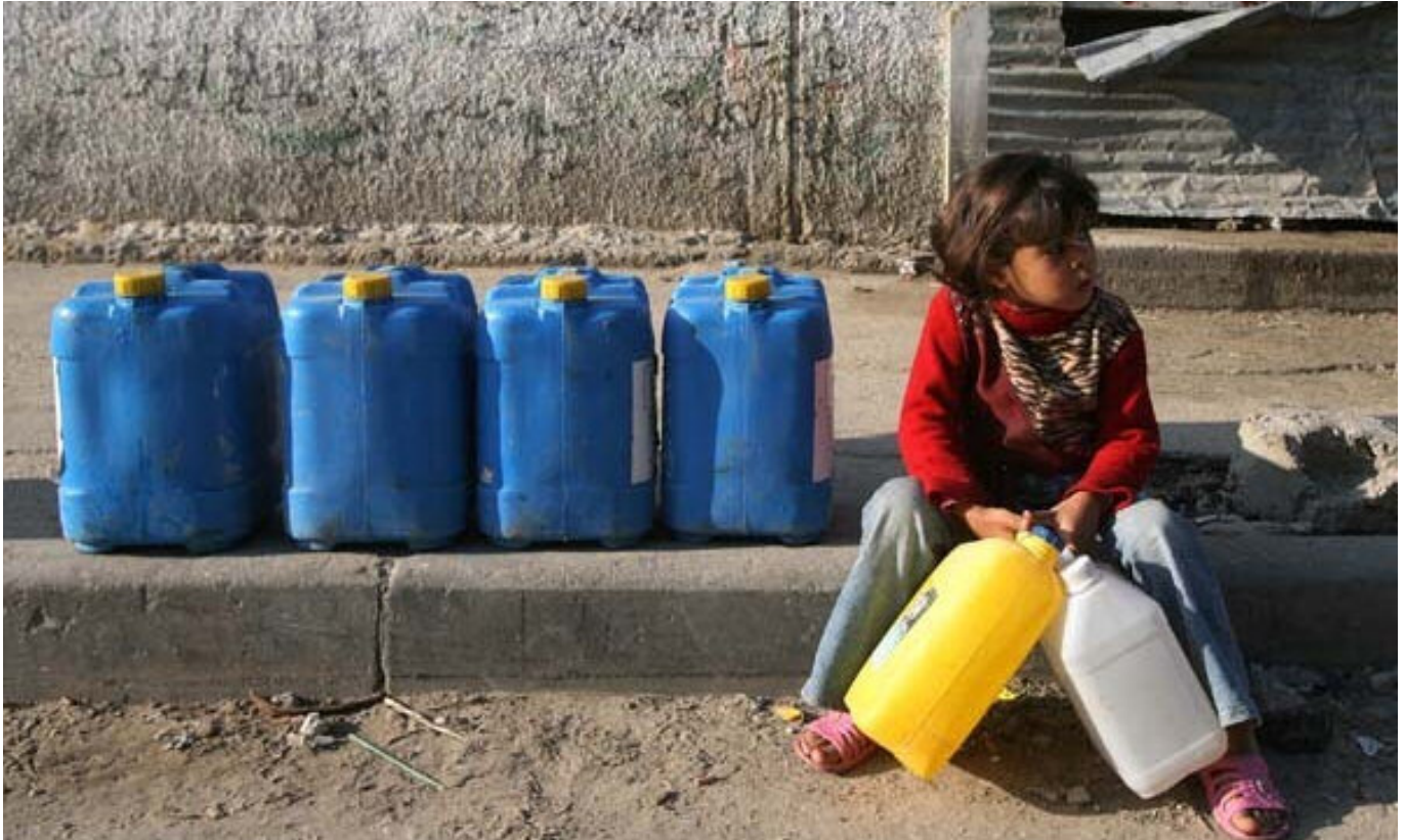
A Palestinian girl takes a rest on her way to collect drinking water in Gaza, where more than 90 per cent of the water available is polluted and unfit for human consumption.