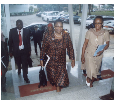
Obiageli Ezekwesili (World Bank) at the National Assembly of Cameroon