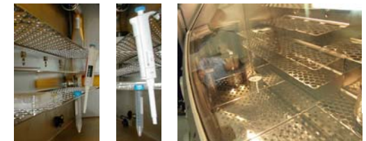
An example of the functionality of the ViVoX TC biosystem. All shelves parts can be autoclaved and replaced. The shelves can also be used for hanging pipettes and test tubes.

The TC Biosystem principles provides an optimal safety against contamination of the processed items as well as securing optimal safety against polluting the environment and secures continuously stable and traceable isotherm and isobar conditions (also for humidity, pO 2 and pCO 2 ) in the workspace and airlock of the ViVoX TC Biosystem™.