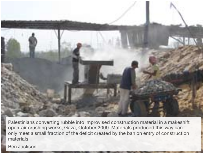
Palestinians converting rubble into improvised construction material in a makeshift open-air crushing works, Gaza, October 2009. Materials produced this way can only meet a small fraction of the deficit created by the ban on entry of construction materials.