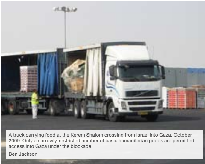
A truck carrying food at the Kerem Shalom crossing from Israel into Gaza, October 2009. Only a narrowly-restricted number of basic humanitarian goods are permitted access into Gaza under the blockade.