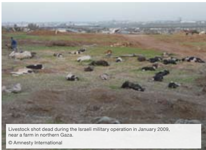
Livestock shot dead during the Israeli military operation in January 2009, near a farm in northern Gaza.