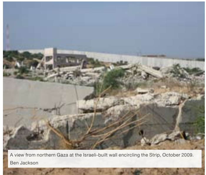
A view from northern Gaza at the Israeli-built wall encircling the Strip, October 2009.

While Israel has a duty to protect its citizens, the measures it uses to do so must conform to international humanitarian and human rights law. Indiscriminate attacks by Palestinian armed groups in southern Israel, which have killed several civilians and injured dozens more, are a clear violation of international humanitarian law. We condemn such indiscriminate attacks against civilians. Abuses of international law by one side, no matter how serious, can never justify abuses by the other side. By enforcing the blockade on the Gaza Strip, Israel is violating the absolute prohibition on collective punishment in international humanitarian law, 67 punishing the entire population of Gaza for the acts of a few.