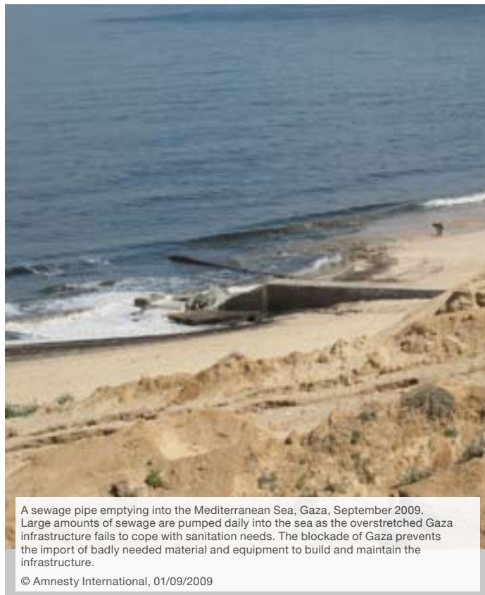
A sewage pipe emptying into the Mediterranean Sea, Gaza, September 2009. Large amounts of sewage are pumped daily into the sea as the overstretched Gaza infrastructure fails to cope with sanitation needs. The blockade of Gaza prevents the import of badly needed material and equipment to build and maintain the infrastructure.

The worsening situation has increased dependence on medical assistance outside Gaza; but here again the blockade bites. The Israeli authorities at Erez Crossing often deny even seriously ill patients permission to exit Gaza for treatment in medical centres in the West Bank, East Jerusalem, Israel, or Jordan. 54 Between January and July 2009 an average of only 51% of patients applying for access to medical care via Erez Crossing were permitted to exit, while the handling of over a third of patient requests was delayed. These patients were not able to exit Gaza on time and missed at least one medical appointment; 73% were delayed for more than seven days. 55