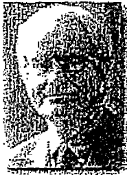
Richard Lambert Director-General of the CBI

Having studied history at Balliol College, Oxford, Richard joined the Financial Times . He edited the Lex column in the 1970s, becoming financial editor in 1979. In 1982 he moved to New York as the Bureau Chief, returning to the UK a year later as Deputy Editor. He became Editor of the Financial Times in 1991 and during his 10 years in this role launched the US version of the newspaper.