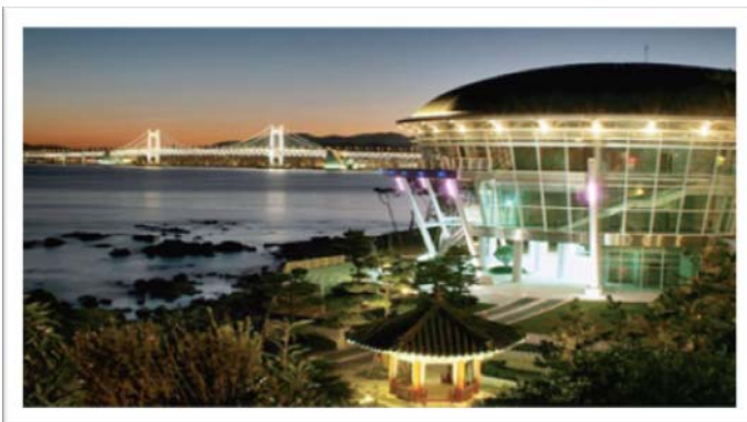
Nurimaru APEC House an annex to BEXCO (Busan Exhibition & Convention Center) where the 3 rd World Forum will be held

The 3 rd OECD World Forum will build on the outcomes of the previous forums, which led to the Istanbul declaration and the establishment of the “Global Project on Measuring the Progress of Societies”. The Global Project is hosted by the OECD and is run in collaboration with several international organisations, non-government organisations, research institutes and leading foundations (see www.oecd.org/progress ). The 3 rd OECD World Forum is not a stand-alone event. In the lead up to the Forum we expect to involve thousands of people through regional and thematic events, and training courses held in Europe, Russia, Latin America, Africa, the Middle East, Australia and Asia. The first results of the Global Project will be presented at the Korean Forum, as well as the recommendations provided by the preparatory meetings scheduled around the world over the coming months.