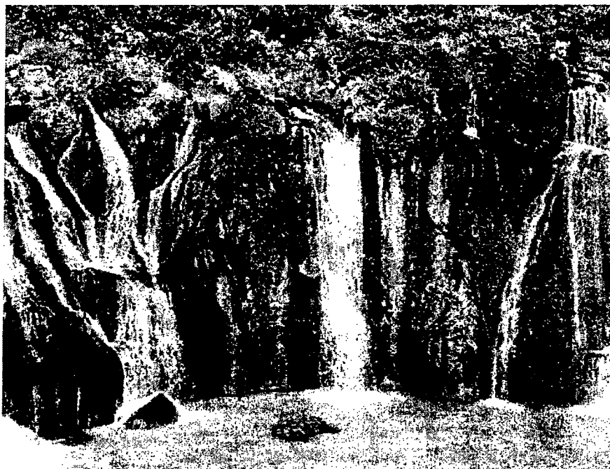
The waterfall Hraunfossar runs in the Hvítá river, Bo