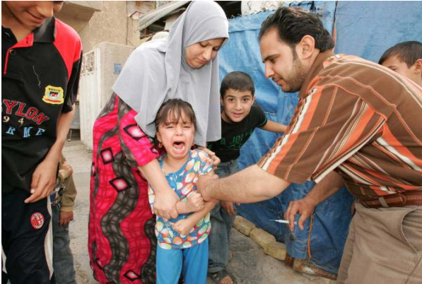
A child is vaccinated during a UNICEF-supported campaign against Measles, Mumps and Rubella in

Protecting Iraqi children's survival and development became tougher in 2007. With violence and displacement still at high levels in the first half of the year, many families were not traveling to health centres. Specialist doctors and other key health staff continued to seek refuge outside Iraq. Insecurity in and around Baghdad delayed the supply of medicines and vaccines to governorates, causing local shortages.