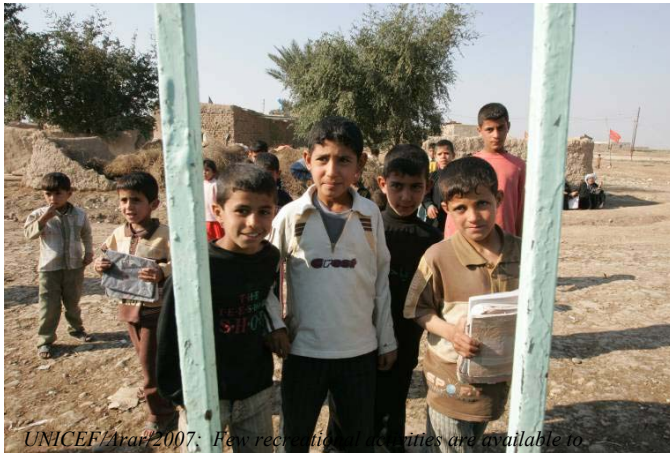
Few recreational facilities are available to schoolchildren in Iraq, and schools are often under-equipped.

So much disruption and ongoing violence affected exam results. One exam centre in Diwaniya was hit by a shower of bullets during an examination session, injuring schoolgirls and killing a mother who was waiting for her daughter outside.