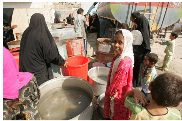
UNICEF water tankering operations are the only source of safe water for many families.

UNICEF and WHO sent medical supplies and ORS to hospitals treating the sick. ORS costs just a few cents a pack and is critical to stop a severely dehydrated person dying from diarrhoea. UNICEF also started to distribute hygiene kits and water purification tablets to families at risk, and supported a public awareness drive to help contain the outbreak. The disease spread to Baghdad, but appears to now be under control nationwide.