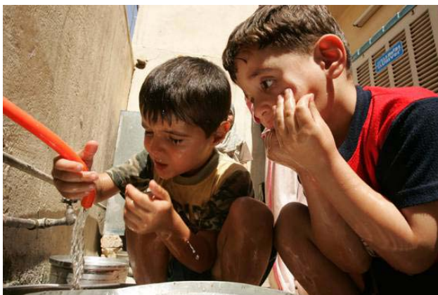
Children in Baghdad drink from a public tap

A growing number of Iraqi families in 2007 became dependent on outside help to access safe water. Lack of safe water and hygiene is now perhaps the biggest threat to the lives of Iraqi children, increasing the risk of illness and death from waterborne disease.