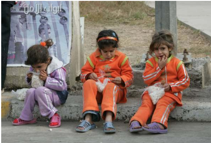
Violence and displacement has reduced many children to poverty and increased the risk of abuse.

2007 condemned a growing number of Iraqi children to a more lonely life. Many struggled with fear and loss, as well as very real threats to their safety. While little hard statistics are available on abuses against children, far too many were stripped of their protective environment of family support, fundamental legal protections and access to school and health care.