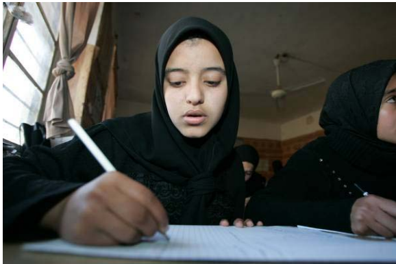
A child enrolled in a UNICEF-supported Accelerated Learning Programme in Wassit

In 2007, children's education was seriously damaged by Iraq's ongoing conflict, despite extraordinary commitment by local officials and families to keep schools functioning. Estimates from the Ministry of Education indicate that net primary enrolment rates may have halved from 2004 levels from 86% to 46% (although lack of accurate population data may affect these numbers).