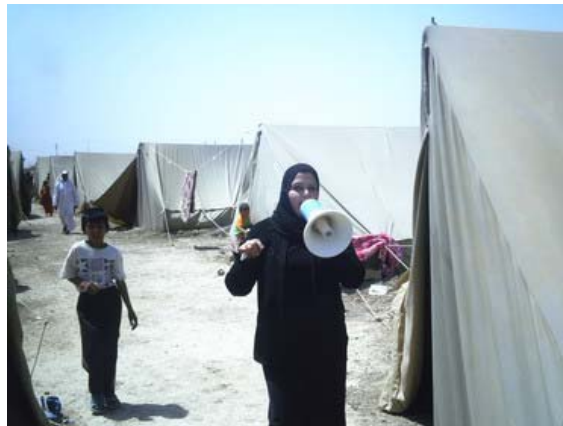
A public awareness campaign for cholera in one of Iraq’s IDP camps.