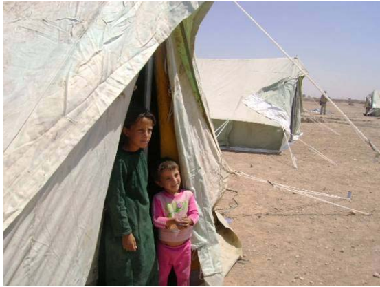
Children of Sinjar wait in tents for aid after the destruction of their homes in a deadly bombing.

Over the course of 2007, the number of Iraqis internally displaced since the 22 February 2006 bombing of the Al-Askari Shrine in Samarra grew from 700,000 in January to over 1.2 million. Most were driven out by violence and intimidation. Half of the displaced were children.