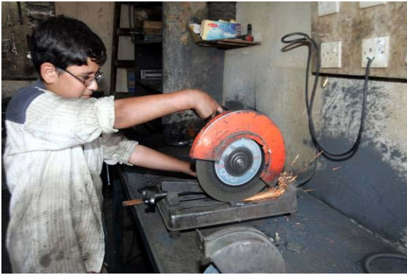
Reports indicate that more Iraqi children are involved in dangerous forms of labour.

Arrest and detention rates for children also increased over the summer, as a result of increased security measures in Iraq's central governorates. By year end, the Multi-National Forces-Iraq announced that over 950 children aged between 10 and 17 years old were being detained in their facilities for alleged security violations, in addition to at least 400 in Iraqi facilities. Ensuring these most vulnerable children receive treatment in line with international human rights law and standards for juvenile justice is a major UNICEF priority for 2008.