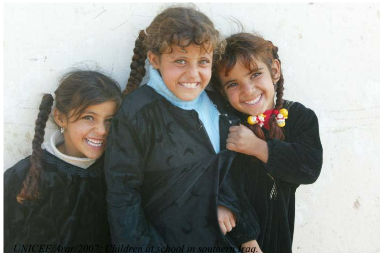
Children at school in southern Iraq.

In 2008, Iraqi children and their families need more help than ever. Whether living in an area disrupted by violence, waiting for aid in a makeshift tent or returning anxiously to an abandoned home, they depend on support from the international community.