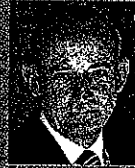
Avo de Boer Executive Secretary UNFCCC