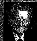
Jean-Claude Trichet President ECB