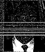
Angel Gurrutia Secretary General OECD