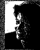
Doris Leuthard Federal Councillor Economic Affairs Switzerland