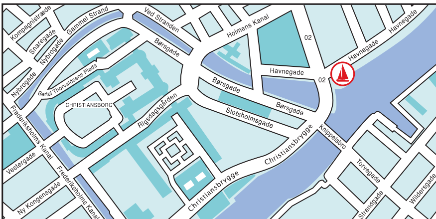
“Song of the Whale” Havnegade, 1058 Copenhagen K, Berth 139