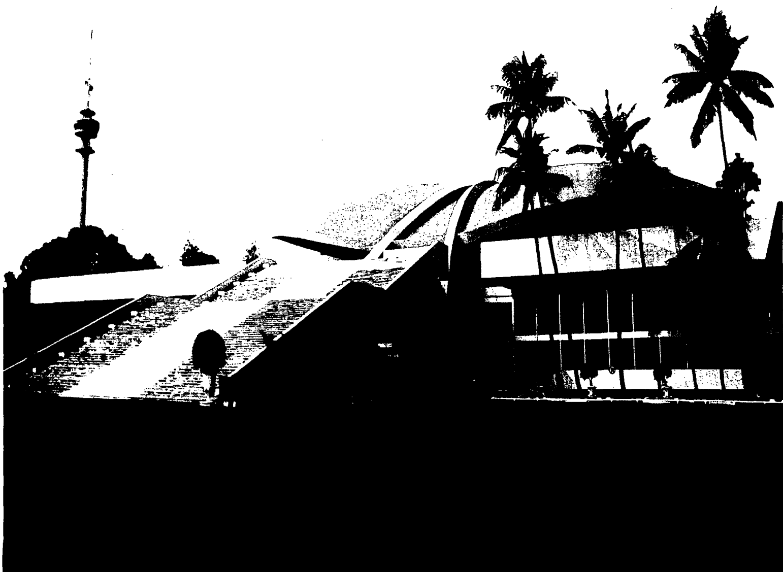
Main Assembly Hall of The Parliament of The Republic of Indonesia

SPEAKER OF THE HOUSE OF REPRESENTATIVES THE REPUBLIC OF INDONESIA