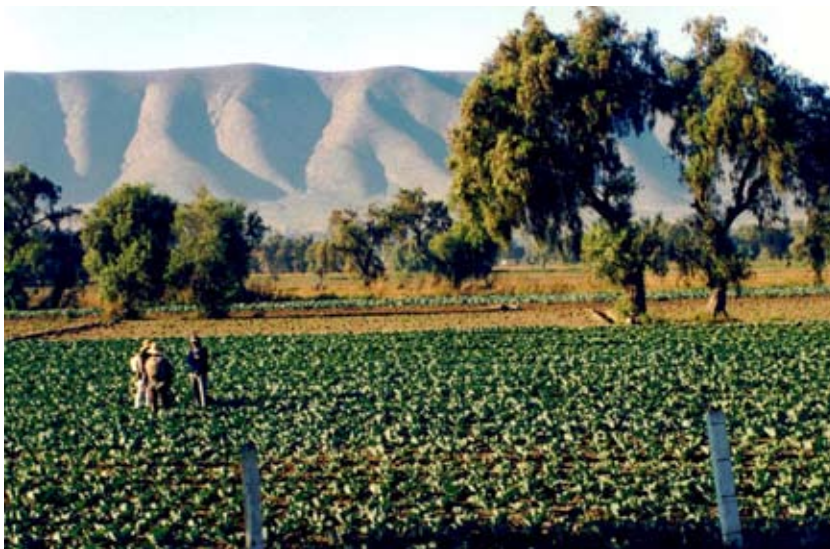
As the U.S. economy tanks, Mexican workers are being forced back into Mexico, where presently there is no work for them. But by developing the PLHINO and PLHIGON water/agricultural projects, there will be plenty of productive jobs. Here, farmers in Puebla, in central Mexico.

of fact. She is the best qualified. She's the most human, and that's a good quality. And she's also extremely intelligent. Her husband is more informed, but she has a fighting spirit, I think, which is greater than his. And therefore, her fighting spiritual regard for the people of the country is a good sign.