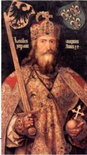
Charlemagne (742-814) developed a system of inland waterways, which had a sequel: the U.S. Transcontinental Railroad developed under Secretary of State John Quincy Adams. The idea was for the United States to become a continental nation, unified from Canada to Mexico, and from the Atlantic to the Pacific, and beyond. Portrait of Charlemagne by Albrecht Dürer (1513); Transcontinental Railroad completed in 1869, Promontory Summit, Utah; John Quincy Adams, President of the United States (1825-29).