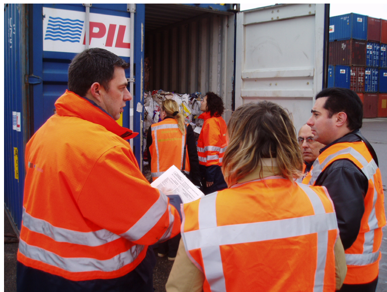
Photo 2.3 Exchange of information between inspectors of various countries

In the course of the project a number of international exchange programmes/meetings were organised. Most visits focussed on the exchange of inspectors and by doing so: learning from their counterparts. The exchange programmes were also useful to experience and discuss the international cooperation with customs, police and the environmental inspectorates. In some cases the exchange of signals between the project participants prevented port hopping.