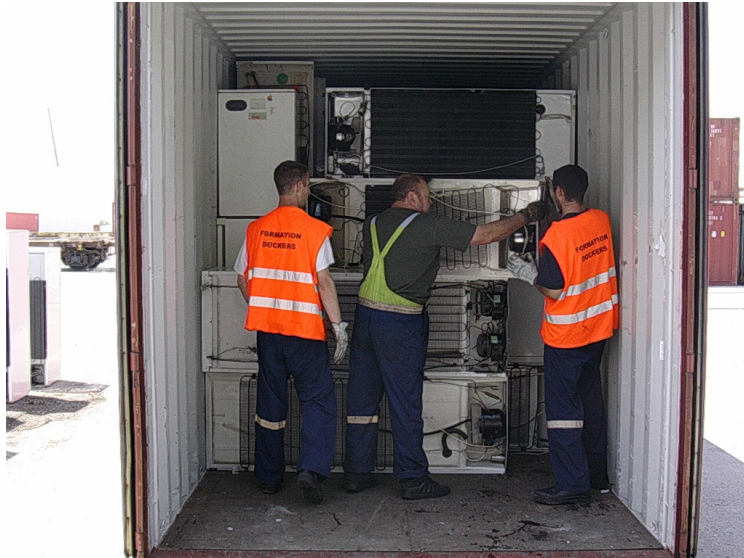
Photo 3.2 Inspection of a suspected container