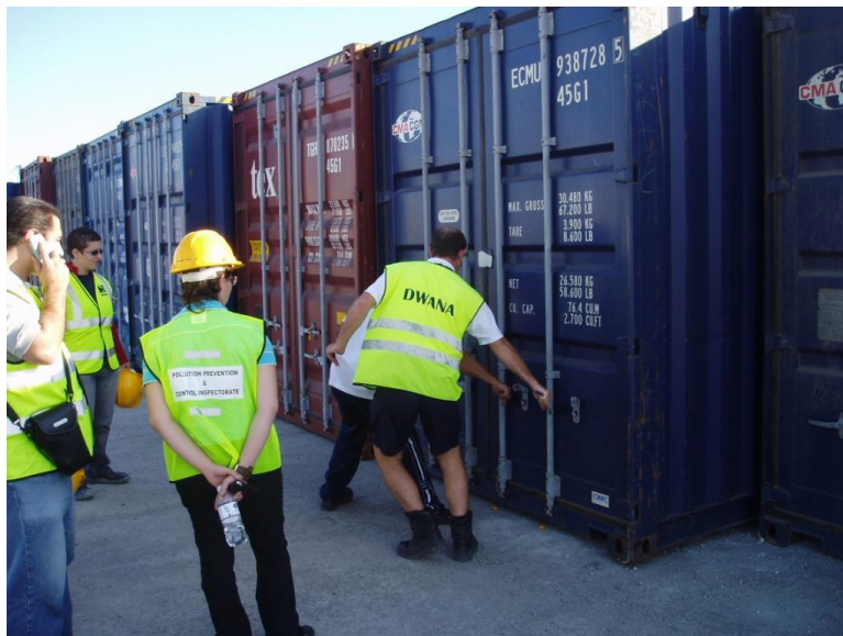
Photo 2.1 Inspection at a container terminal

A description of these methods is enclosed in annex 2.