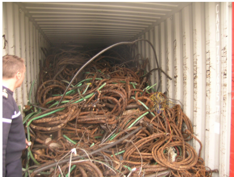
Photo 3.2 Export of cable waste containing PCB's

Attention was raised on the outcomes of enforcement activities to the public, and within the management of the organisations involved. Press releases, interview with the press (TV and written media), and articles raised public and political attention. Within some countries questions were raised by members of the Parliament. Also the European Parliament requested some answers of the European Commission on illegal waste shipments and cooperation with customs.