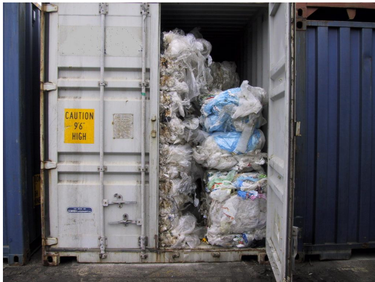
Photo A.2.6: Illegal shipment of plastic waste from Italy to China, via Slovenia

A shipment of mixed plastic waste from Italy to China was detected by customs in Luka Koper at the beginning of March 2006. Customs blocked 10 containers with approximately 170.000 kilograms of mixed plastic waste. The shipments were returned to the country of origin (Italy).