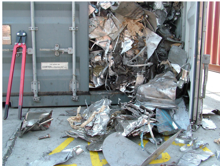
Photo 2.2 Iron or steel scrap from Poland to South Korea

In total, 24.052 administrative/ document checks and 4.198 physical checks have been carried out. During these physical checks, 1.103 shipments of waste were identified. 564 of these shipments were found to be illegal (51%). 473 shipments were detected with infractions (43%), like missing or incomplete information with respect to article 11 of the Regulation 4 . Follow up actions were taken in these circumstances, like returning illegal shipments to the country of origin.